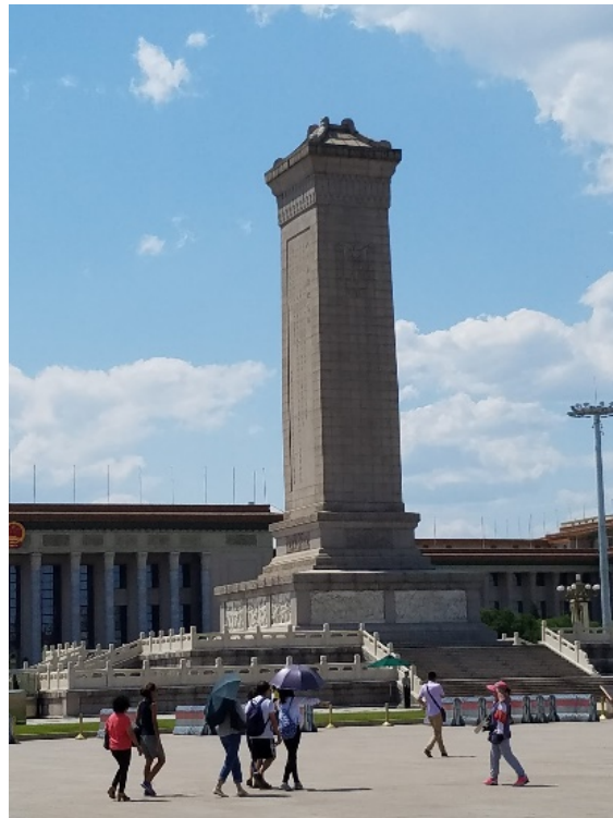
Figure 4. Photo of the Monument to the People's Heroes in Beijing.

The length of Xing's poetic drama naturally entailed the creation of a more fleshed-out and embellished account of Wang Erxiao's martyrdom than Fang and Li's seven-verse folksong. In addition to Erxiao's political acumen and martyrdom (of which more will be said later), the figure of the enemy garnered greater attention from the author. Xing's detailed portrayal of the enemy both defines and produces community. Whereas the 1942 song only mentions "the enemy" three times and never explicitly identifies them, Xing's piece eschews ambiguity in its portrayal of the young martyr's persecutors. Within the first few lines of the opening act we learn the identity of the poem's principal enemy: "murderous and ruthless Japanese bandits" who have descended upon Erxiao's village as part of their "mopping-up" campaign. In addition to an external enemy, the poem also features an internal enemy, in the figure of a "traitor." His identity as a "landlord's son" and "member of the Guomindang" highlights the centrality of class and lingering sense of paranoia that marked socialist-era articulations of community (Xing Y 1963).