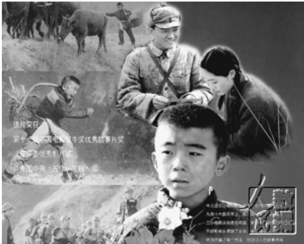
Figure 5. Collage of images from the 2003 film adaptation of the Wang Erxiao story Shaonian yingxiong 少年英雄 (Young hero).

project to mold the new child. Although Nationalist Scout discourses militarized children’s culture in the years leading up to the War of Resistance, the dominant view of childhood promoted by the Nationalist Party was premised on a notion of children as “patriotic consumers” and “future masters of the Chinese nation” (Pozzi 2014, 105). In short, Nationalists regarded children primarily in terms of their potential as consumers and future citizens of the republic. By contrast, Communists identified children as “revolutionary successors” who were expected to assume a vanguard role in defending the socialist community and contributing toward the realization of a Communist future. Communist perceptions of children as viable political actors were reflected in the abundance of cultural productions that featured children as heroes and martyrs; foremost among these was the story of Wang Erxiao. At the same time, however, socialist-era narratives of child martyrdom brought to the fore tensions that arise in politicizing and aestheticizing the death of a child and were laden with an existential anxiety triggered by the premature death of the “revolutionary successor.”