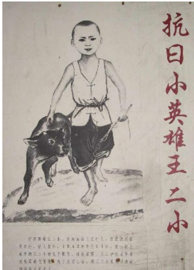
Figure 1. Poster of “The Little Hero of the War of Resistance—Wang Erxiao.” Date unknown.

(1967–1980), who sacrificed himself in the Iran-Iraq war, 5 and the Soviet Union’s Pavlik Morozov (1918–1932), who was killed by his relatives after denouncing his father to the authorities. 6 What, then, are we to make of the Wang Erxiao story and the phenomenon of child martyrdom in mid-twentieth-century China? More specifically, for the purposes of this article and its focus on Chinese socialist culture, how were stories of child heroism and martyrdom like Wang Erxiao’s inserted into narratives of socialist revolution? And how do the authors of these texts address the inherent tension in using the death of a child, a tragic and lamentable event, for political and ideological purposes?