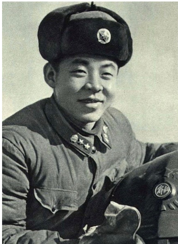
Figure 3. Photo of Lei Feng.

Guerillas on the Plain ( Pingyuan youji dui 平原游擊隊), this poetic drama was published in the PRC's most important political newspaper, People's Daily ( Renmin ribao 人民日報). Its appearance on May 29, 1963 coincided with Mao's launching of the Socialist Education Program, a massive propaganda campaign aimed at reversing capitalist trends in post-Great Leap Forward society by promoting "collectivism, patriotism, and socialism" (Spence 2013, 531). The CCP's propaganda apparatus used heroes and models to reintroduce socialist values into Chinese society and cultivate greater loyalty to Mao and the party. The most famous model-hero to emerge during this period was Lei Feng (1940–1962), a member of the People's Liberation Army whose dedication to Mao and attitude of self-sacrifice epitomized the values the CCP sought to inculcate in the nation's citizens (figure 3). Mao's proclamation on March 5, 1963, to "Learn from Lei Feng" ("Xiang Lei Feng xuexi" 向雷鋒學習) initiated the Lei Feng cult and simultaneously encouraged the creation and circulation of other stories like it (Larson 2009, 110–111). It was by no means a coincidence, then, that Xing's iteration of the Wang Erxiao story appeared just two months later in People's Daily .