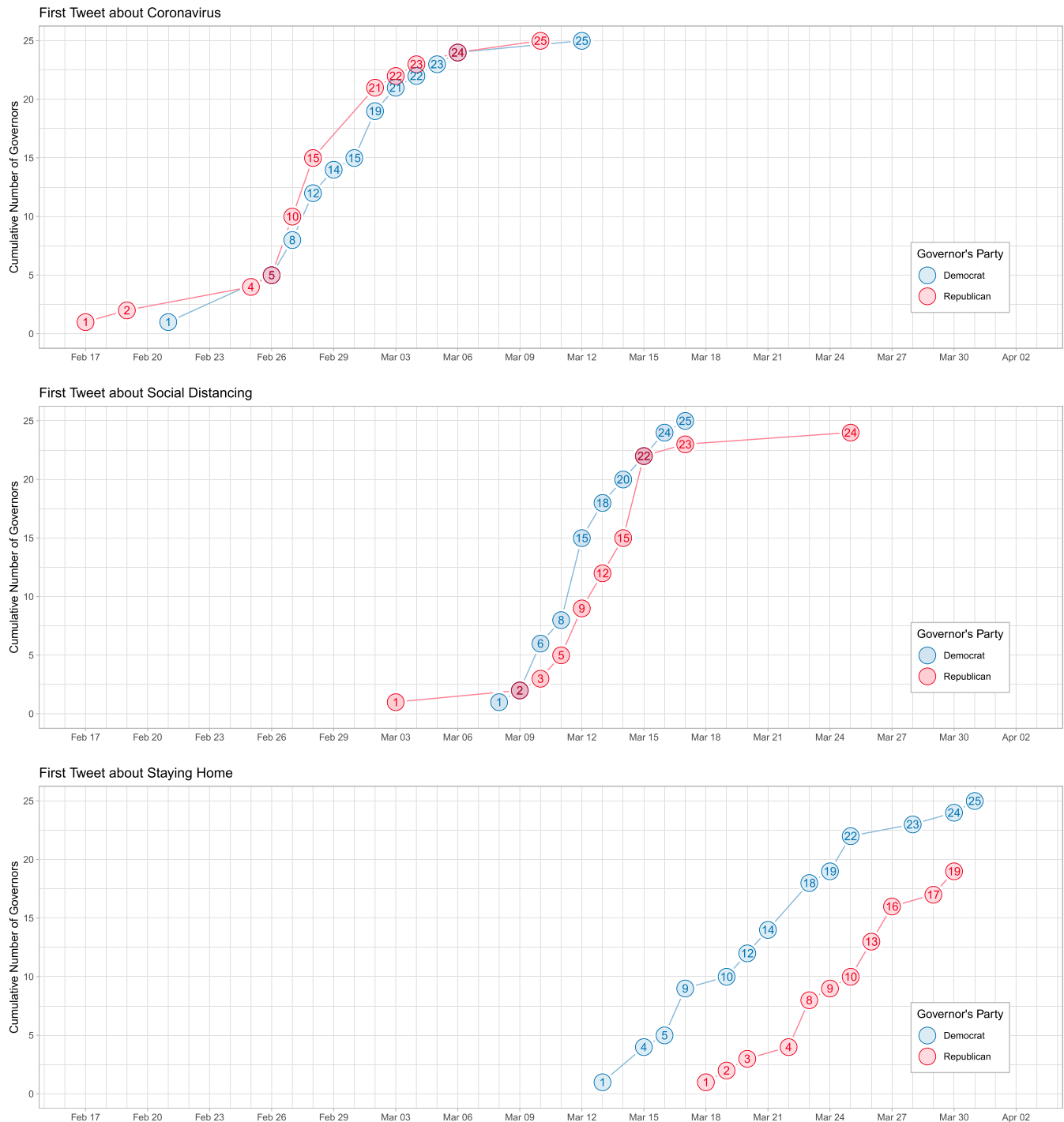
Fig. 1. Governors' tweets by topic. Figure shows the cumulative number of governors tweeting about coronavirus ( Top ), social distancing ( Middle ), and staying home ( Bottom ) by date and governor partisan affiliation. The governors of Alaska (Republican [R]), Florida (R), Georgia (R), Iowa (R), South Carolina (R), and South Dakota (R) did not tweet about staying home (shelter-in-place) during this time period.

Democratic-leaning counties than Republican-leaning counties (Table 2, Panel A, column 2). Our estimates indicate that a 10 percentage-point increase in President Trump's vote margin reduced the effect of governors' communications on mobility by about 1.7 min, or 10.7% of the effect size in a county where Clinton and Trump were tied in 2016. Nonetheless, the overall effect of governors' communications on mobility remained large and significant in both Democratic- and Republican-leaning counties ( SI Appendix, Fig. SI-10, Left and Table 2, Panel B).