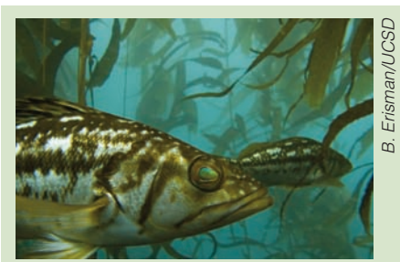
A kelp bass in the La Jolla Ecological Reserve