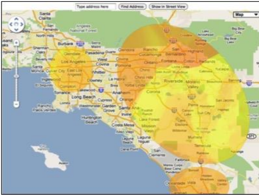
Figure 1: Underwriting engine "buy box" indicating areas to focus acquisition activity