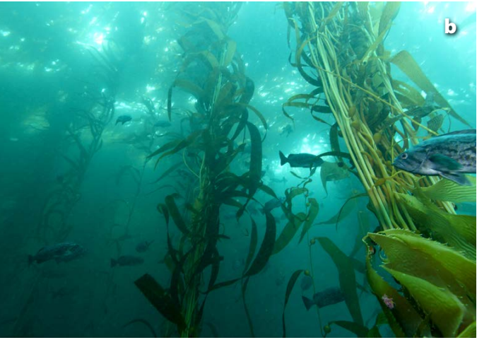
FIGURE 2. Monitoring and research in rocky intertidal and kelp forest habitats of the California Current Large Marine Ecosystem. PISCO programs study biogeographic patterns of the structure and function of these important ecosystems through quantification of macroalgae, invertebrates, and fishes. Research approaches allow quantification of large- and small-scale spatial patterns in the biological communities and characterization of changes over time. Ongoing oceanographic work provides information about environmental variables,

using, for example, moorings, bottom-mounted sensors, and autonomous vehicles. Data collected provide insight into the causes and consequences of ecosystem changes resulting from natural and anthropogenic drivers. (a) Macroalgal-dominated Fogarty Creek, Oregon, is one of PISCO's long-term monitoring and research sites. Rocky intertidal reefs are important testing grounds and experimental "laboratories" for ecologists worldwide because of their accessibility, steep environmental gradients, and relatively rapid turnover of organisms living there. (b) A typical central California kelp forest community shot taken at approximately 12 m depth near Pebble Beach. Kelp forests of the eastern Pacific coast are dominated by two canopy-forming, highly productive brown macroalgal species—giant kelp, Macrocystis pyrifera , and bull kelp, Nereocystis luetkeana . These forests are home to a high diversity of fishes, invertebrates, and other algae, including economically important species such as sea urchins, abalone, lobster, rockfishes, and other finfishes. Photo credits: (a) Bruce Menge , OSU (b) Chad King , NOAA NMBS