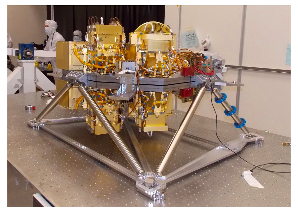
Figure 3: Integrated Science Instrument Module.

"Over the course of its decades-long development, it marked a wave of groundbreaking optical technology focused on creating innovative solutions to complex problems."