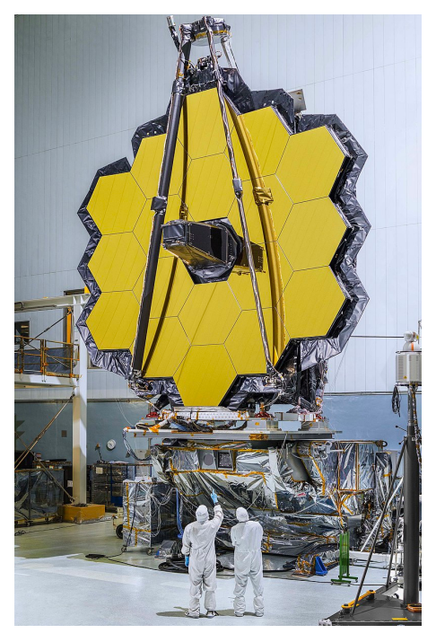
Figure 1: The James Webb Space Telescope.