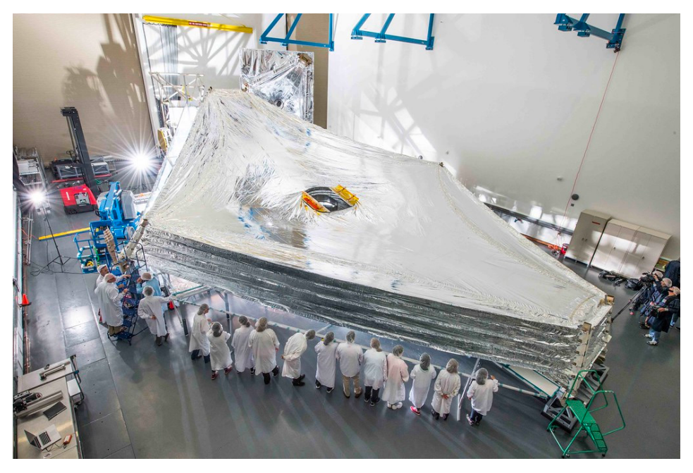
Figure 4: The specialized Sunshields on JWST.

James Webb is an incredible step forward in the fields of astronomy and astrophysics. Over the course of its decades-long development, it championed a wave of groundbreaking optical technology focused on creating innovative solutions to complex problems. This telescope is a new chapter in deepening our understanding of the universe by solving century-old problems, and in the process, we may uncover larger mysteries that govern the universe. James Webb will soon help us better understand our universe and its future, and consequently, more about humanity and our place in the cosmos.