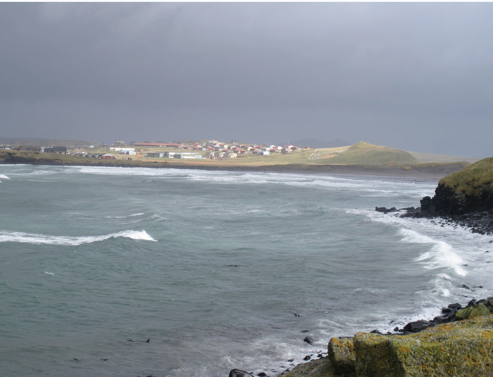
▼ The town of St. Paul taken from Gorbach Bay, on the southern tip of the island.

In December 2021, shortly after the unfortunate passing of Mayor Pletnikoff in August 2021, the ACSPI used the massive amount of literature and knowledge gathered to compose and submit a formal nomination to the NOAA Office of National Marine Sanctuaries (ONMS). The nomination details an area that fully encompasses the existing