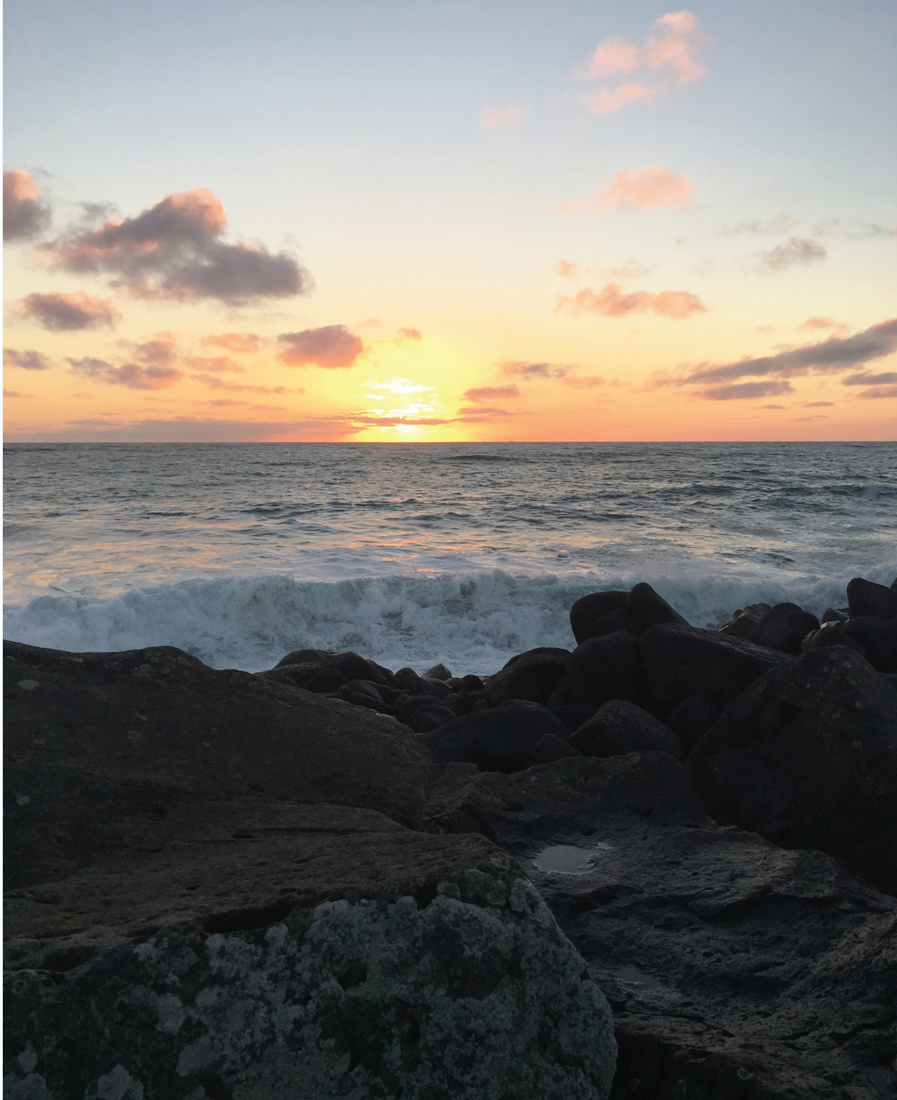
▲ Sunset on St. Paul Island, Alaska.

result in a loss of the duration, quality, and extent of critically important sea ice. More frequent and violent storm conditions are causing new and major erosion issues. 10 Studies also predict that by 2040–2050 conditions may no longer support eastern Bering Sea (EBS) commercial fisheries, a major industry in the global economy. 11,12