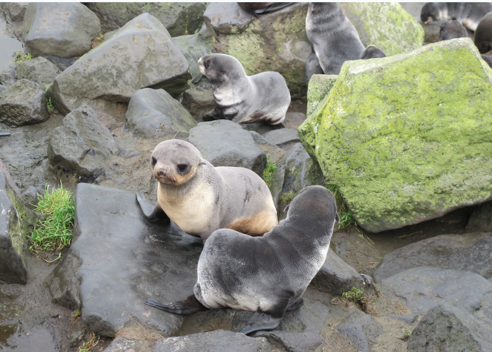
▼ Northern fur seal pups on a rookery (breeding area) on St. Paul Island, Alaska.

Unangaꝥ (Aleut) communities on the Pribilof Islands of St. Paul and St. George are directly experiencing a rapidly transforming marine ecosystem, including alarming declines of fur seals, sea lions, seabirds, fish, and invertebrates, with real costs to wildlife, human and ecosystem health, local economies, and culture. Northern fur seals have declined to roughly a quarter of the peak historic population estimate of 2.1 million animals. Changing distributions and abundances of fish such as chagiꝥ, or Pacific halibut ( Hippoglossus stenolepis ), an important species for Unangaꝥ subsistence, economy, and culture, are making access increasingly difficult. Warmer water temperatures