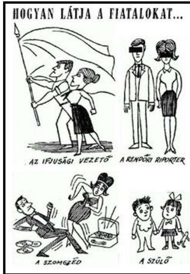
Figure 4-1. How young people are viewed by... Top Row (left to right): The Youth Leader, The Police Reporter; Bottom Row: The Neighbor, The Parent. Népszabadság , March 29, 1964.

traditional Leninist assertion that the youth were important allies of the socialist revolution. Too young to have played a major role in the revolution, this generation of young people was the first to come of age in the more permissive atmosphere of Kádárism, which made them important symbols of the Kádár government. For the parents who had raised their children through the hardships of the Second World War and the Rákosi period, young people also had important significance. As one article in the Guardian explained, “Such parents have high hopes for their children. They have few worldly goods to leave them and instead wish to bequeath a heritage of