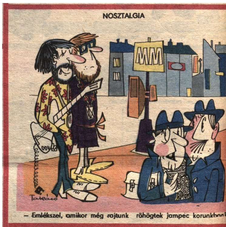
Figure 4-6. Remember during our jampec phase when they sneered at our fringe? Ludas Matyi , January 16, 1969.

many adults were too quick to judge young people based on outward appearance or new customs (for example being friends with members of the opposite sex). Béla Radnai, a docent in Budapest's Eötvös Loránd University's Psychology department, remarked, "It is lucky that young people are more understanding with us adults than we are with them," and argued that adults were oftentimes too quick to judge young people, especially on outward appearance. 106