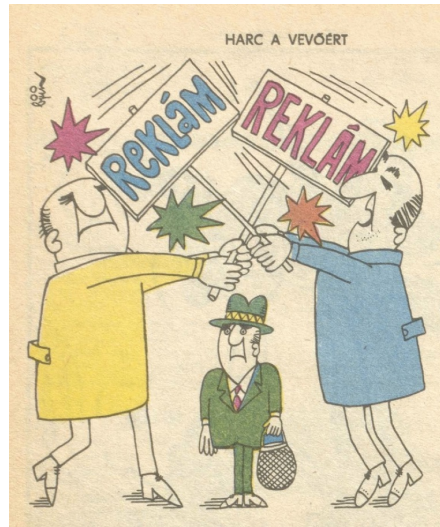
Figure 2-3. Battle for the Customer. Ludas Matyi , January 29, 1970

In the new system of economic management, the demand for promoting products is increasingly apparent. MRT must prepare itself for the anticipated rise in advertisement or advertising programs. The preparation of advertisements for radio and television, and their effectiveness, relies in large measure on the knowledge of special possibilities. In the interests of the national economy, therefore, it is important that MRT carries out this activity. 125