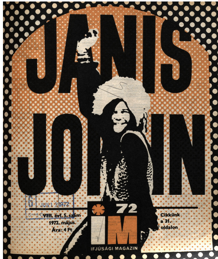
Figure 4-2. 1972 cover of Ifjúsági Magazin featuring Janis Joplin. Ifjúsági Magazin , May 1972.

because in the creation of the appropriate political and pedagogical proportions, in the matter of determined and resolute behavior, and in the direction of youth interests, we must strive to increase the magazine's freshness and level of interest." The editorial staff of Ifjúsági Magazine thus strove to both educate Hungarian youth and provide them with material that young people would find entertaining. Throughout the 1960s, it continued to feature popular fashion and music trends, although these were often coupled with political caveats relating to the government's youth policy.