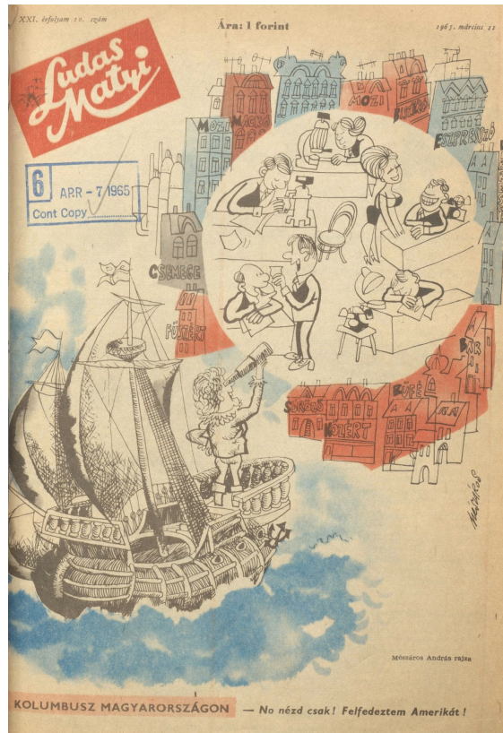
Figure 2-2. Columbus in Hungary – Behold! I have discovered America.

economic mechanism 77 (NEM), which was the result of several years of planning and preparation, and was intended to give more autonomy to individual companies in order to alleviate some of the problems endemic to the command economy. NEM was never fully implemented; however the reforms enacted under NEM had implications for consumption in Hungary and brought Hungarian producers and sellers more firmly into the discussion of increasing living standards.