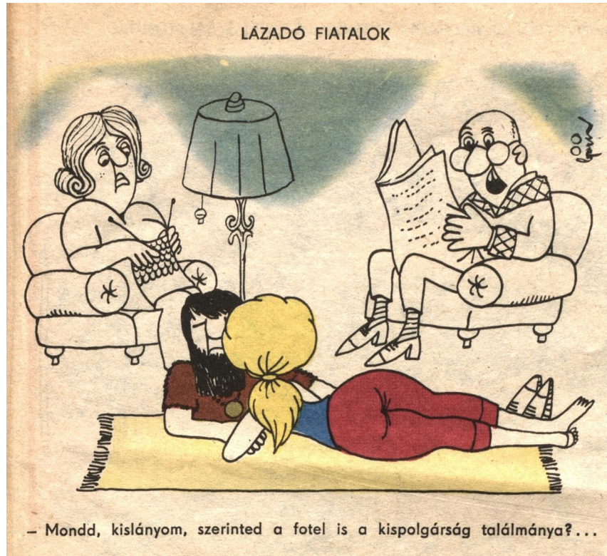
Figure 4-3. Tell me daughter, do you think even armchairs are a petty bourgeois invention? Ludas Matyi , July 15, 1971.