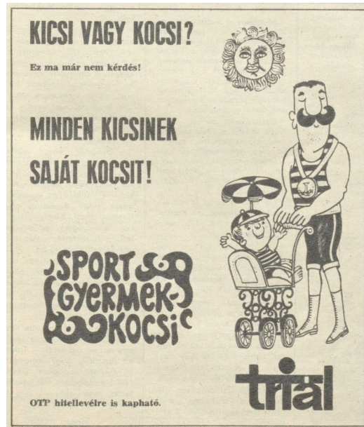
Figure 2-4. Child or Car? It is no longer a question! Every child can have his own car! Nők Lapja , August 23, 1969.

theory, and that indeed providing for society was one of the primary goals of building socialism. At the same time, they promoted the idea of the socialist consumer: a person whose consumption habits were rational and whose purchases were made with the intention of improving oneself and society.