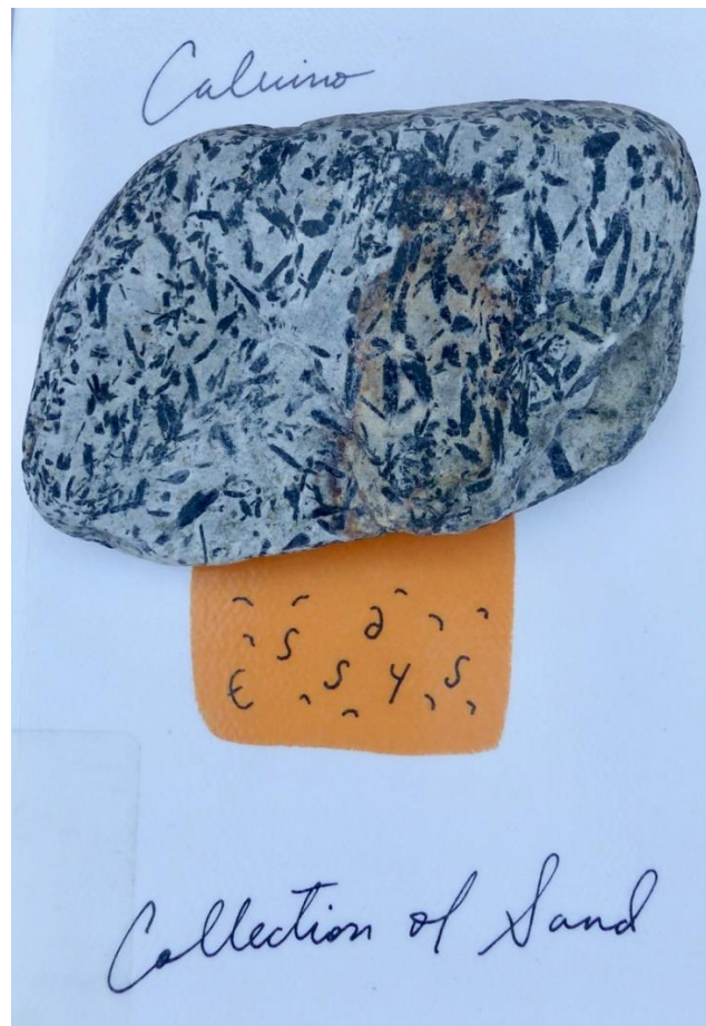
Fig. 3. Pierre Jardin, Collection of Sand and Asemic Stone, 2022.

We may examine how these strands coalesce in a geo-poetic essay in Collezione di sabbia (1984, Collection of Sand ), “I mille giardini” (“The Thousand Gardens”). Here, the link between stones and language is made from the outset. Calvino begins by describing “a path made of irregular stone slabs” that is “ the raison d’être of the garden, the main theme of its discourse, the sentence that gives meaning to its every word.” “But,” he asks, “what meanings?” 84 Calvino then both describes and enacts—in elegant, deliberate, incremental sentence segments—a central element in Japanese garden design: how each stone, each step, provides a new perspective; how, at each step, a new landscape takes shape; and how “each scenario in turn is broken down into views that take shape as soon as one moves,” culminating in the realization and experience that “the garden multiplies into endless gardens.” 85