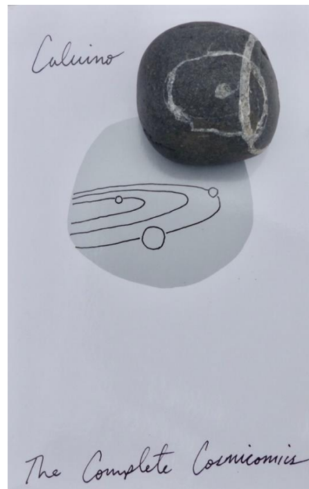
Fig. 2. Pierre Jardin, basalt concretion on book, 2022.

As a mash-up of genres, the Cosmicomics indeed are a mark of Calvino's innovation as a fiction writer. In using a “comic” form (in both senses) to convey scientific theories and translate them to human scale, the Cosmicomics are forerunners of projects like Larry Gonick's The Cartoon History of the Universe (1990–2002).