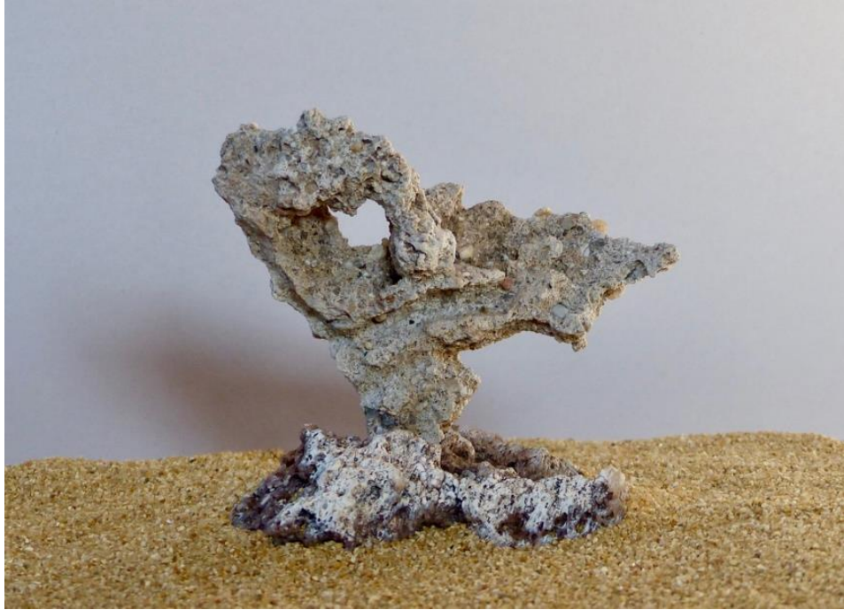
Fig. 4. Pierre Jardin, A Lightning Flash of Insight , 2022. Pierre Jardin found this fulgurite in the Yuha desert. Popularly called “lightning glass,” it is created when silica is vitrified (heated and melted) by a lightning strike. Jardin found it shocking to think of a rock formed by a lightning bolt. Picturing the rock’s creation, Jardin realized that the rock formed in the brief, dreadful silence after a rumble of thunder and before a flash of lightning, in this case striking the desert sand. In tribute, he mounted the fulgurite on a small rock found nearby, with a white mineral streak that neatly conjures a lightning bolt.