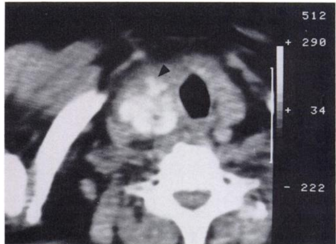
FIGURE 3. CT scan (without intravenous contrast) showing slight deviation of the trachea to the left and extensive calcification throughout the tumor.

Thyroid gland scintigraphy shows both primary extrasosseous osteosarcoma and cyst as a cold nodule. With ultrasound, the tumor is usually well margined but may show infiltration into surrounding tissues. A cyst will be well demarcated. Calcifications are easily identified in both lesions, but differentiation between the two may be possible by characterization of the echo pattern. In primary extrasosseous osteosarcoma, the tumor has a mixed echogenicity throughout, and the calcifications are compact and distributed throughout the tumor. The cyst is anechoic or hypoechoic, and the calcifications are peripheral, coarser, and more irregularly distributed. The compact pattern of calcification as seen with osteosarcoma is unusual in patients without history of a goiter.