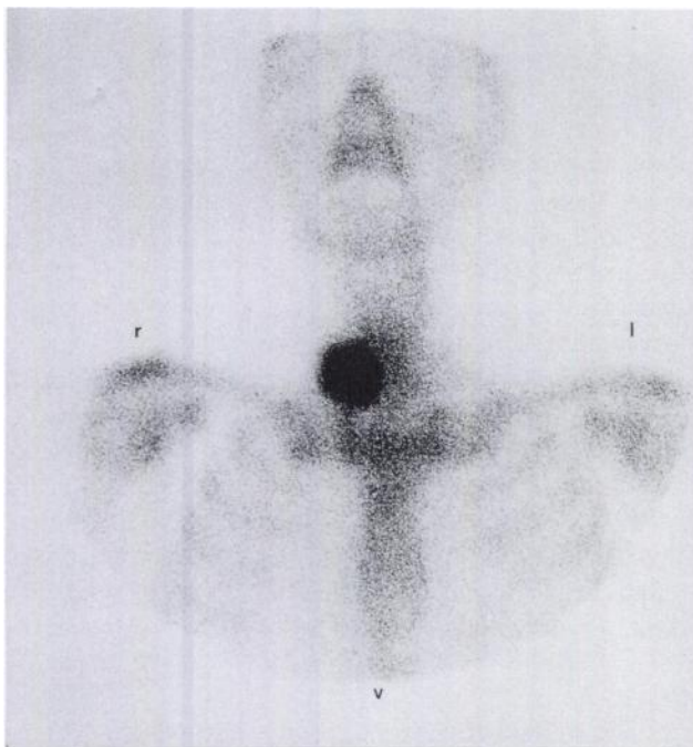
FIGURE 2. Bone scintigraphy with ^{99m}\text{Tc} -DPD. There is intense uptake of radiotracer in the mass.

Because of the tumor mineralization associated with primary extrasosseous osteosarcoma of the thyroid gland, the primary alternative differential diagnostic consideration is a calcified cyst. The combination of several imaging modalities will often allow differentiation of these two entities (Table 1).