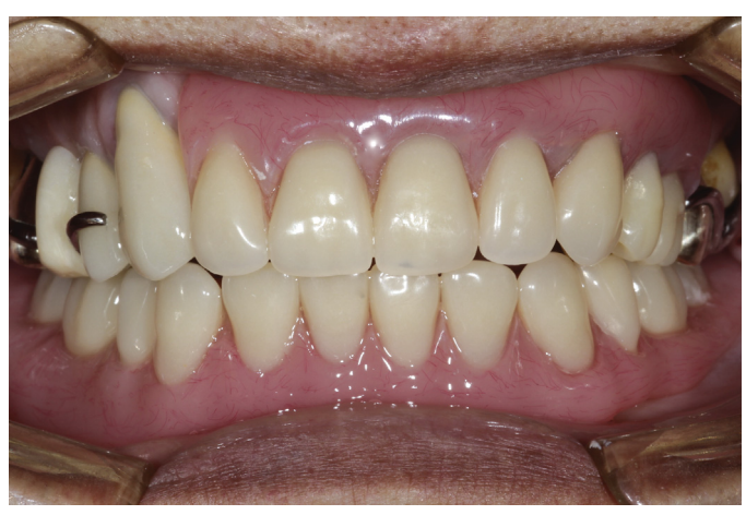
5 Definitive maxillary removable dental prosthesis and mandibular implant overdenture.