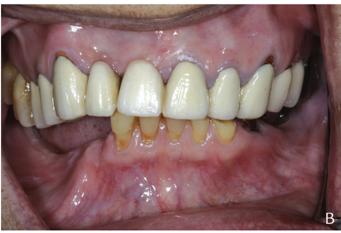
1 A, Pretreatment facial view. B, Pretreatment intraoral view.