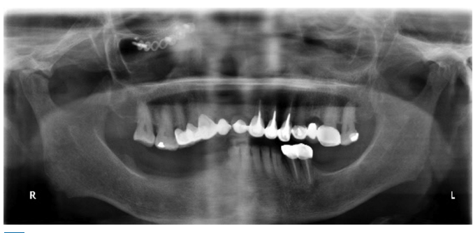
2 Pretreatment panoramic radiograph.