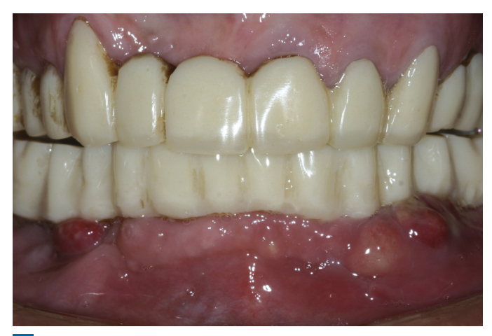
4 Swelling around implants at time of removal of fixed interim prosthesis.

3 implants retained by Locator attachments (Zest Anchor) and for maxillary survey crowns and a maxillary partial removable dental prosthesis. The definitive maxillary partial removable dental prosthesis and mandibular implant overdenture were delivered (Fig. 5). Despite multiple adjustments over a 3-week period, the patient reported difficulty controlling her tongue or mandible, which contributed to problems in speech and chewing. The patient observed that her mandible was shaking more than before the teeth were extracted. Three weeks after the delivery of the definitive restorations, the patient fractured the metal ceramic crown on her maxillary right canine (Fig. 6). No wear on the opposing acrylic resin teeth was noted, but without her mandibular prosthesis, the Locator attachment in the mandibular right canine position contacted the lingual of the maxillary right canine during her involuntary mandibular movements. Recordings of her involuntary movements were made with a video camera (Canon Rebel t3i; Canon). She exhibited an elliptical pattern of the mandibular movement from left to right, with protrusive tongue movement and continuous lip smacking. A consultation with her physician was completed, but because of patient management issues, the physician was unable to change her medications.