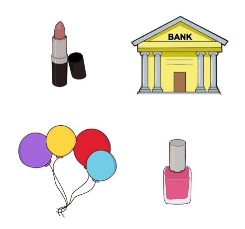
Figure 1: Example of an experimental display.

These were recorded at a normal speaking rate and were then slightly adjusted using speech processing software so that the duration of the verb and the following determiner was equal across the four versions. The other eight experimental displays were accompanied by sentences in a separate control condition in which the verb information could not be used to predict the target object (e.g., Control: "The man touched the kettle", display objects: kettle, umbrella, sofa, table; display not shown due to space limitations). The materials were pretested by having a different group (N = 25 Mechanical Turk) click on one of the four clipart objects that best completed sentences with missing patient information. The sentences were created by pairing each character mentioned in the lure conditions with the main verb e.g., "the clown blew up ..." and "the criminal blew up ...". We chose only those agentpatient pairs on which raters agreed over 95% of the time. In addition to the critical displays, the materials contained 32 filler displays accompanied by sentences with a range of syntactic structures, different emotional intonations (sad and happy), and in which the verb information was compatible with two, three or four objects in the display.