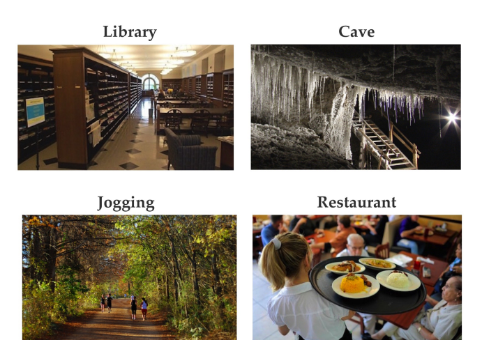
Figure 1: Four sample scene pictures used to elicit norms

(Permissions), or is "not allowed" to perform (Prohibitions), or is "supposed" to perform (Prescriptions). This betweensubjects manipulation of norm type was constant across pictures so that each participant answered the same question (e.g., "What are you permitted to do here?") for all four pictures they encountered.