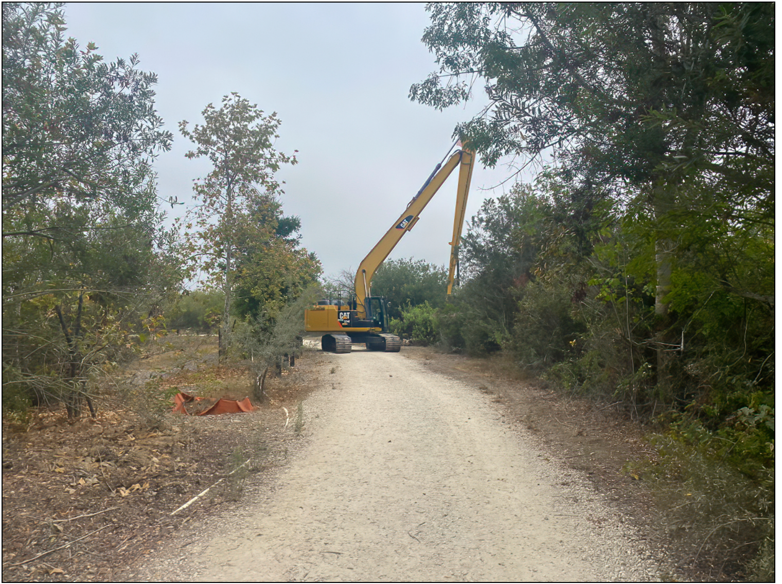
CAT excavator removing sediment from Phelps Creek.