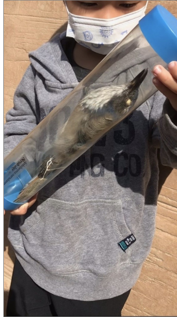
Right: How else can you get this close to a California scrub jay?