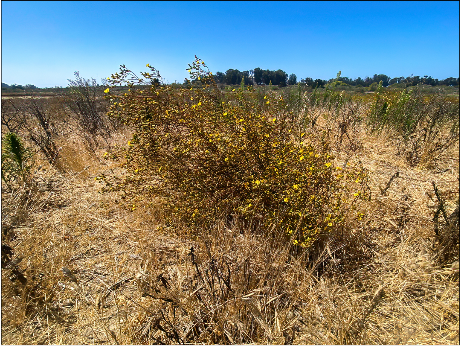
Slender tarplant ( Deinandra fasciculata ).