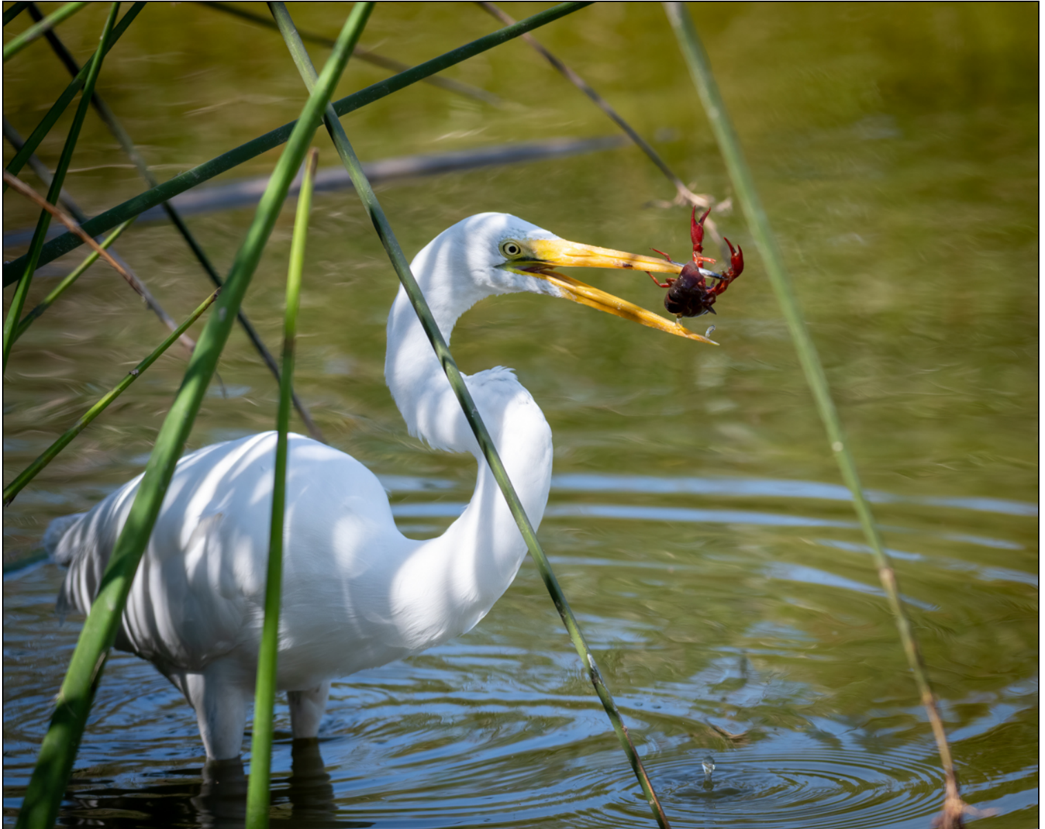
Great Egret assisting with invasive crayfish removal at Whittier Pond.