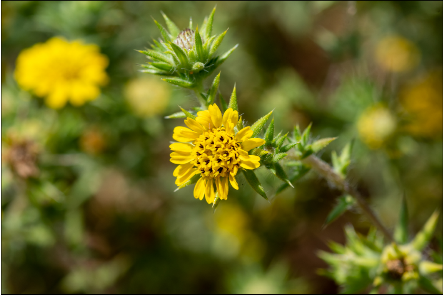
Southern Tarplant leaves are stiff and spine tipped.