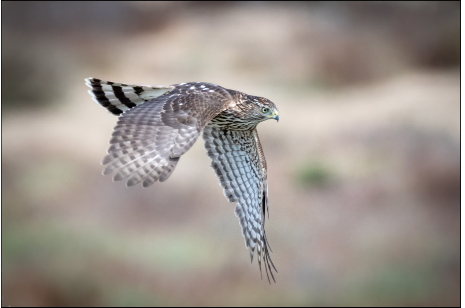
Juvenile Cooper's Hawk hunting on the Mesa.