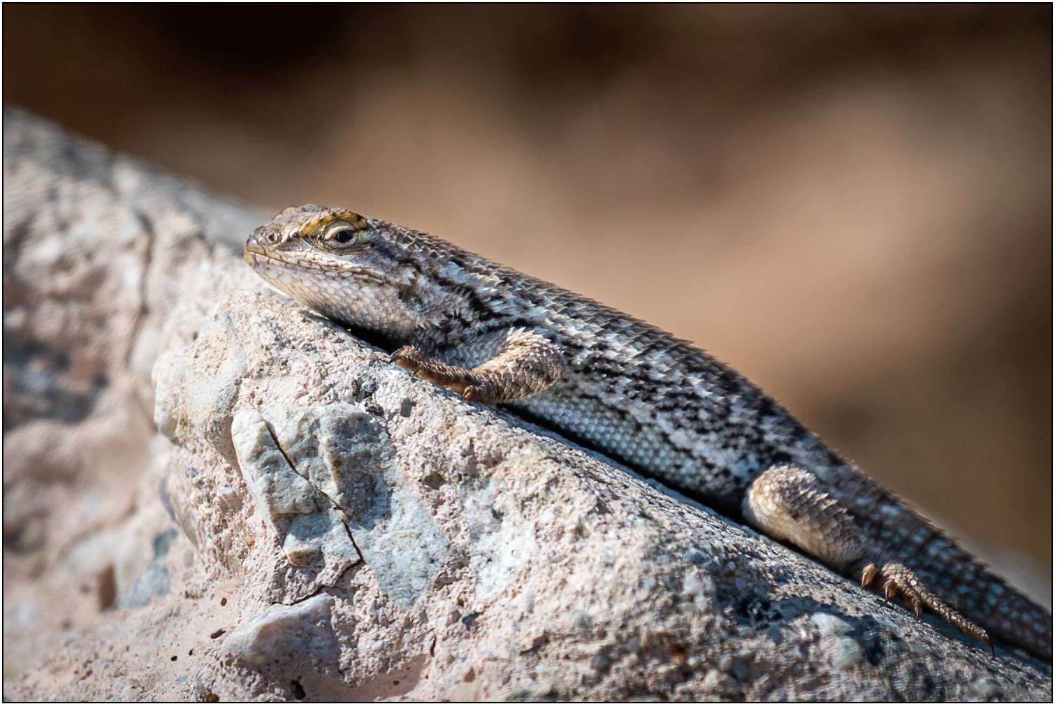
Western Fence Lizard ( Sceloporus occidentalis ) sunning on hibernacula.