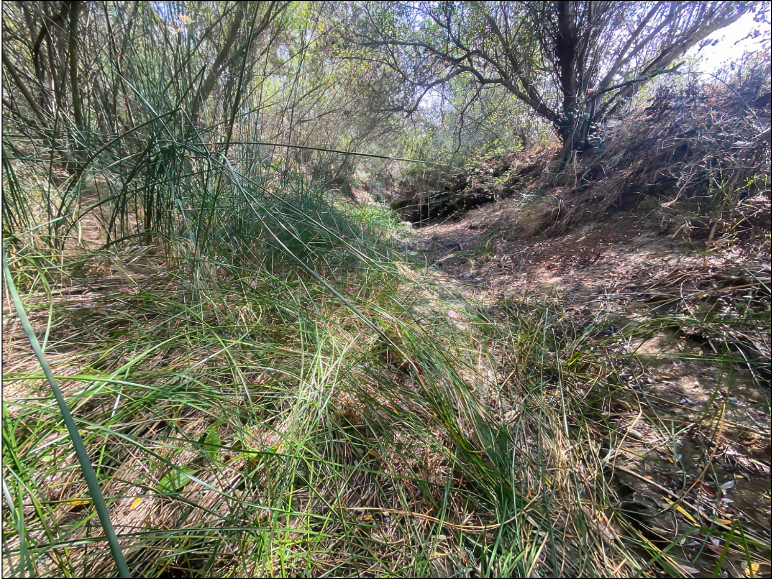
Vegetation was building up within the Phelps Creek channel before dredging took place.