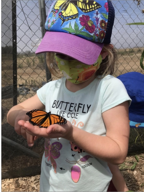
Left: This young entomologist came prepared and was teaching us about the butterfly life cycle when we got a surprise visit from a freshly emerged monarch.