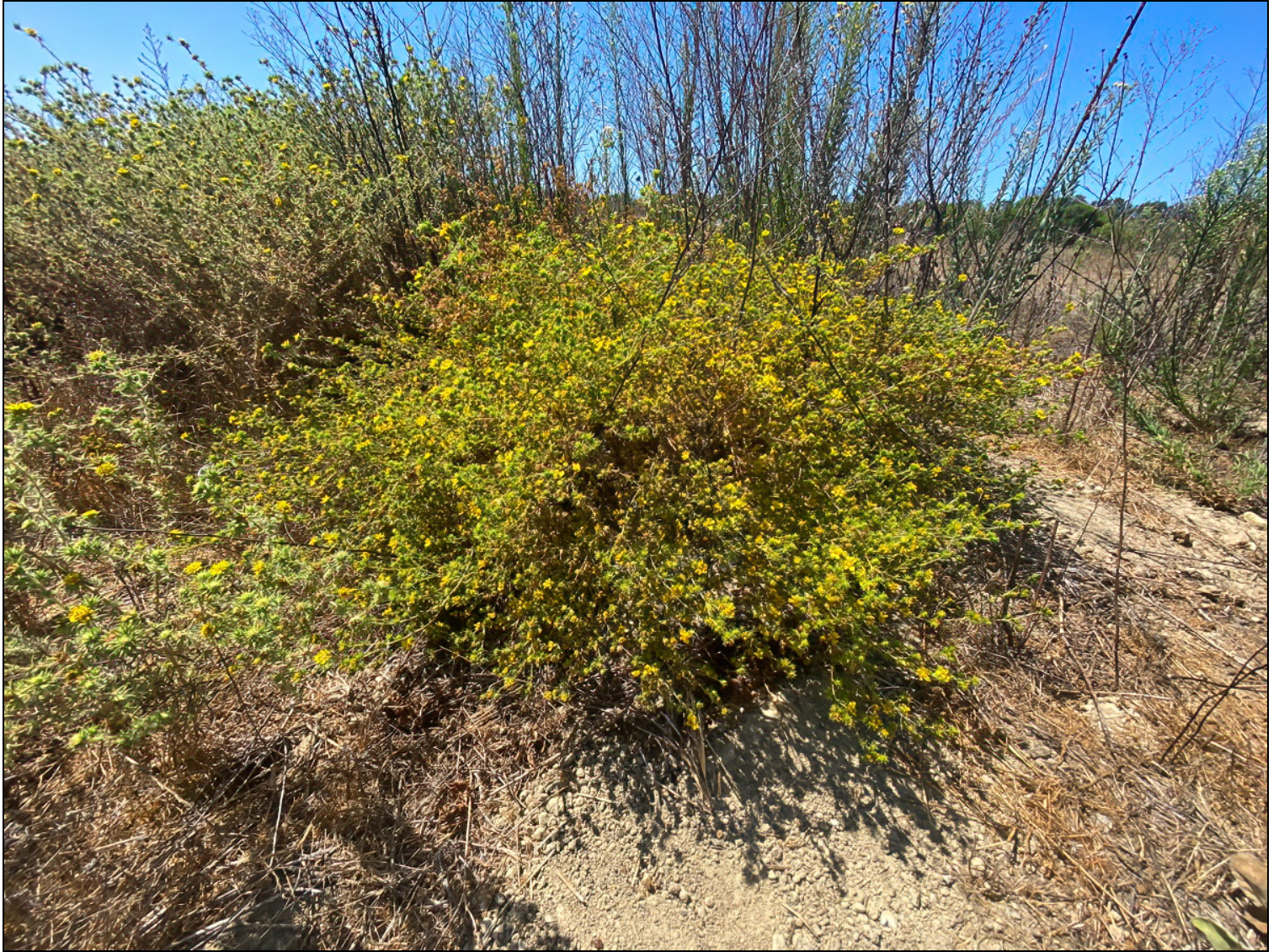
Possible Hybrid between Southern Tarplant and Slender Tarplant.