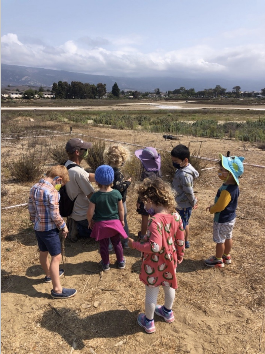
Getting a different perspective of the wetland from off trail.