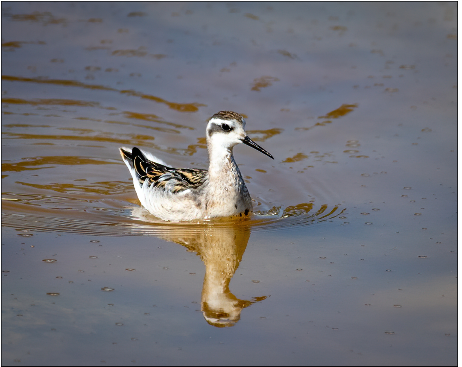
Red-necked Phalarope seen at Venoco Bridge.