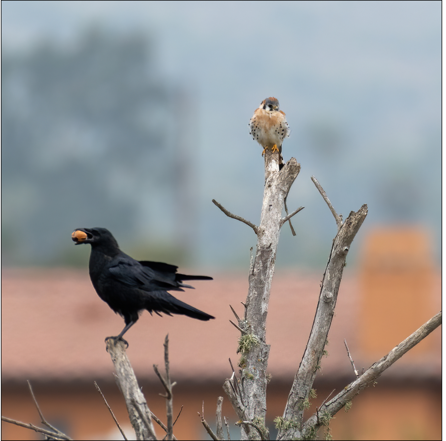
An American Kestrel and American Crow share a perch in the southwest of NCOS.