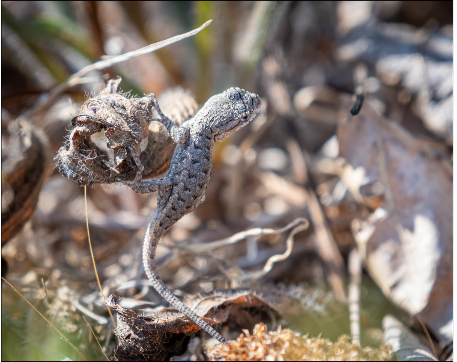
Baby Western Fence Lizard ( Sceloporus occidentalis).

Received this email from a friend? Click here to subscribe to our mailing list.