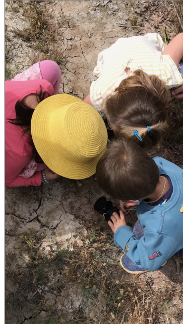
Right: So focused on finding bugs!

We are excited to resume educational visits this summer after over a year of restrictions that prevented organized field trips to North Campus Open Space. Currently ongoing is a collaboration with Orfaea Family Children's Center (OFCC) funded by UCSB's Coastal Fund. NCOS's proximity to OFCC makes it an ideal destination for these 2- to 5-year-olds to explore, learn, and connect with nature. For some of the students, NCOS is like their backyard. For others it is a new experience, but all are just as excited as they trek from school to the wetland. A few of the older students even remember back to 2019 when they got to plant wetland plants with CCBER staff that are still thriving on the estuary edge.