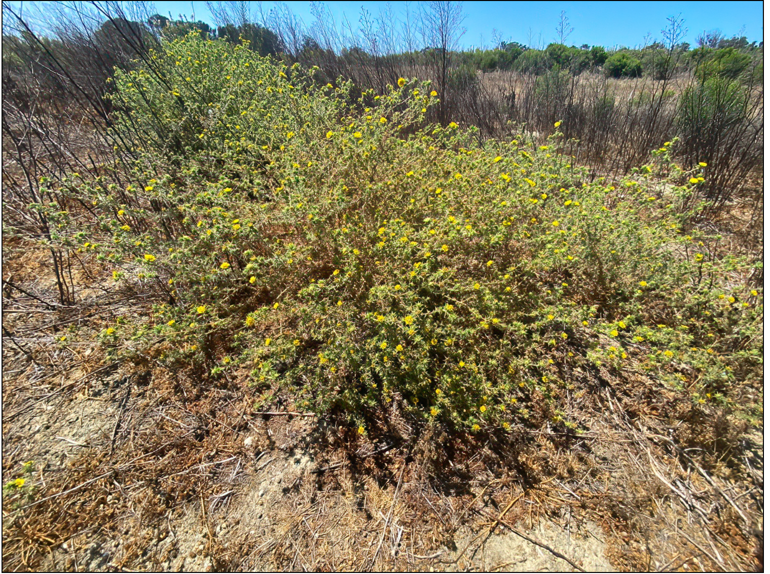
Southern Tarplant ( Centromadia parry ssp australis ).