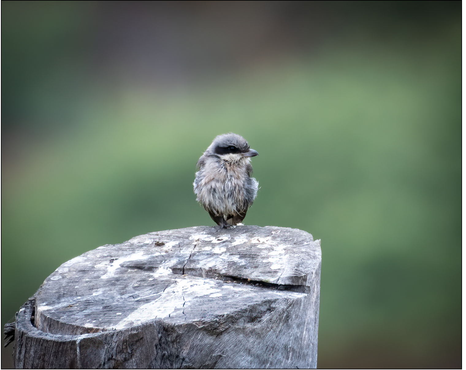
Loggerhead Shrike.