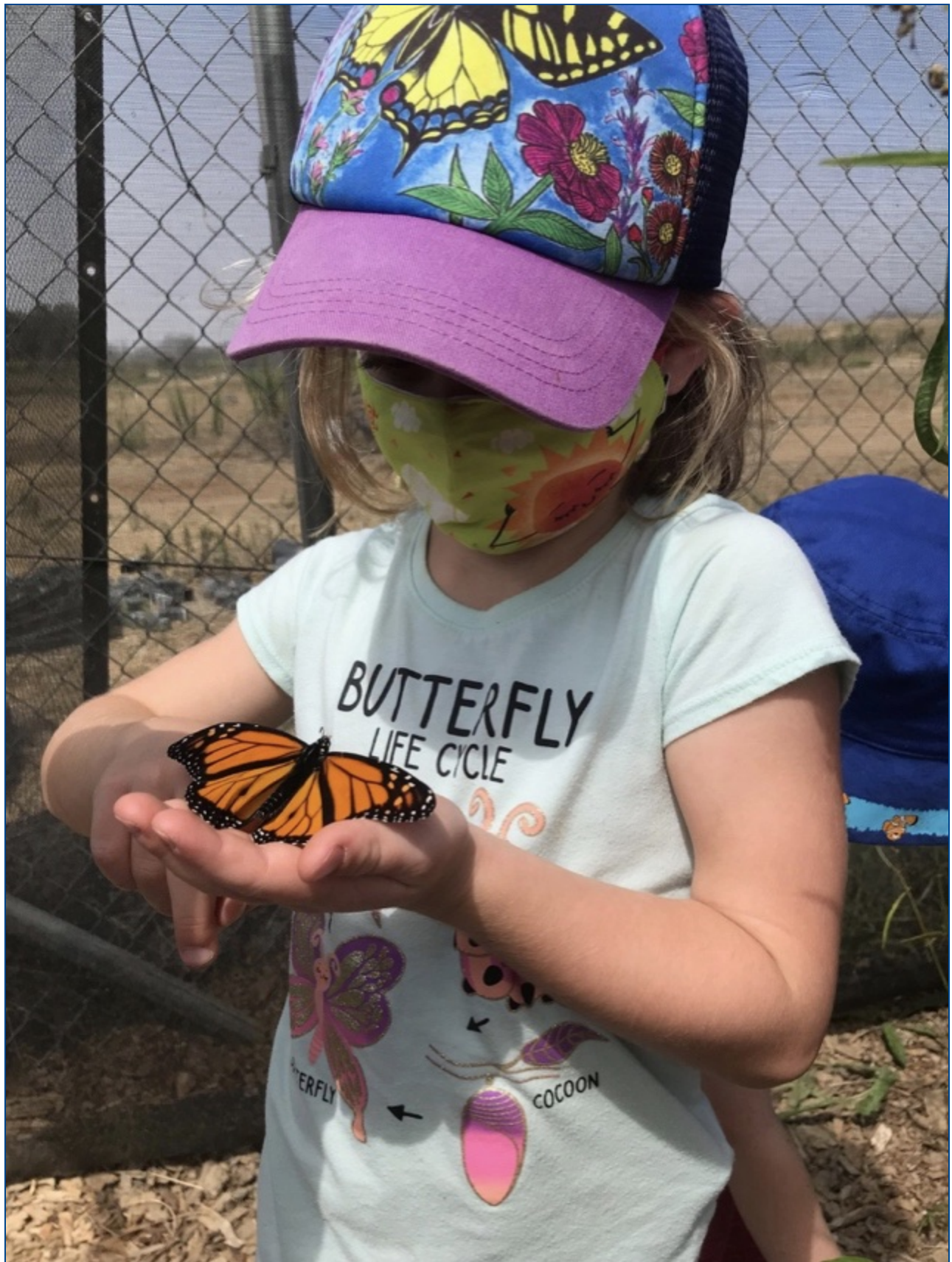
This young entomologist came prepared and was teaching us about the butterfly life cycle when we got a surprise visit from a freshly emerged monarch.

We are excited to resume educational visits this summer after over a year of restrictions that prevented organized field trips to North Campus Open Space. Currently ongoing is a collaboration with Orfaea Family Children's Center (OFCC) funded by UCSB's Coastal Fund. NCOS's proximity to OFCC makes it an ideal destination for these 2- to 5-year-olds to explore, learn, and connect with nature.