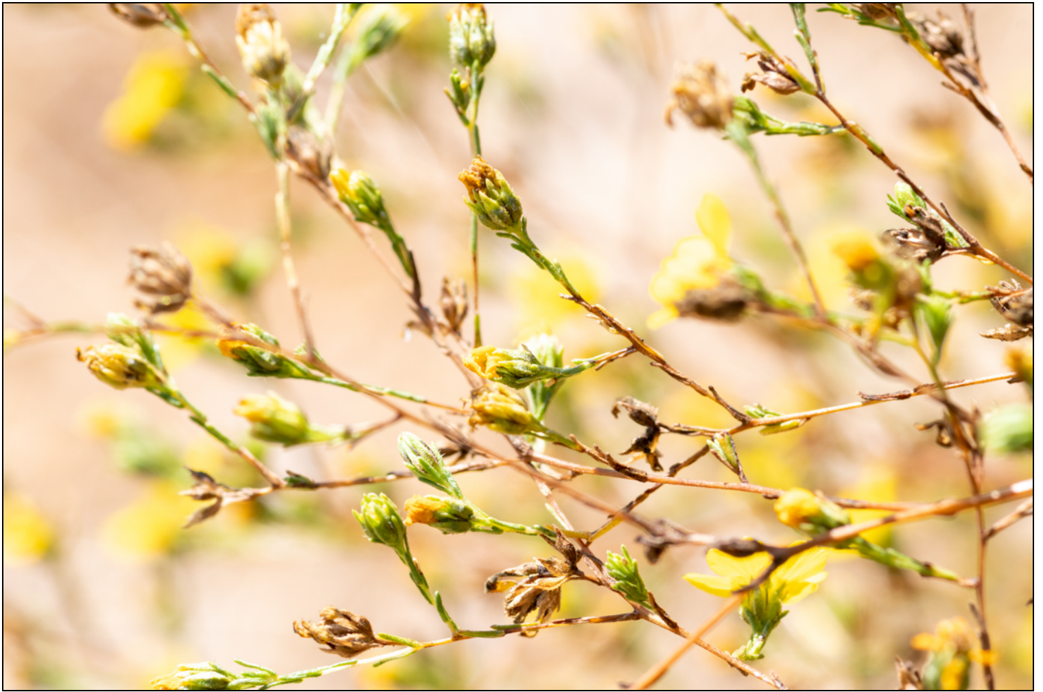
Slender Tarplant has fascicled, or clumped, leaves.