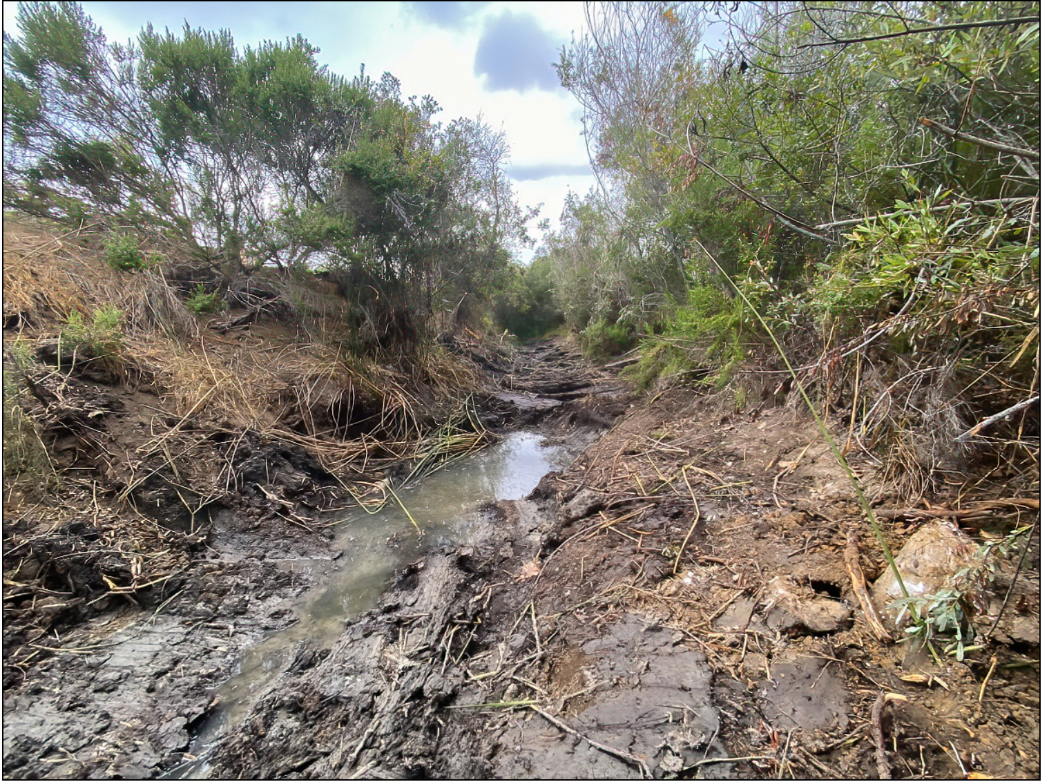
Phelps creek post-dredging.