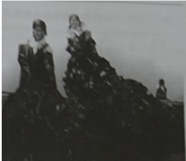
Image 5. Women Harvesting Seaweed 78

Some people believed that women had advantages in seaweed aquaculture. When I interviewed rural women, those who had worked in sea farming told me that women had more deft hands than men, and almost every boat sailing out to farm seaweed had one man and one woman on board. 79 Men were responsible for rowing back and forth and harvesting by cutting full grown, massive seaweed off ropes and dragging it to the boats. Women were responsible for attaching seeds to ropes, adding fertilizer, and some land processing work.