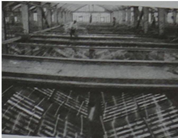
Image 6. The Seedling Rearing Room. 125

The official report said, “the needs for sea treasures increased as Chairman Mao's diplomatic policy prevailed and as more and more foreign leaders visit China. Therefore, China's traditional marine treasures such as sea cucumber, scallops, abalone are in high demand.” 123 The last example that reflected the growing attention to technology and science at the farm was the establishment of a processing workshop to turn fresh fish and mussels into cooked food, including fish balls, grilled fish, mussel soup, and even mussel soy sauces. 124