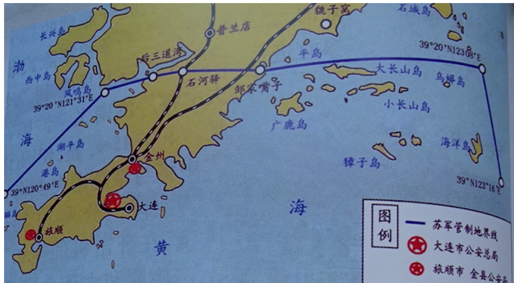
Map 2. The Area Where the Soviet Army was Stationed 19

Despite its initial shock at the Sino-Soviet Friendship Treaty in which the Soviets recognized Chiang's Nationalist government as the only legitimate government of China, the Communist Party was able to take advantage of the Soviet presence in Manchuria. The Soviets gave the CCP considerable assistance, including the use of the port and railways to transport troops and cadres from outside the Northeast, to help the Communists establish their presence in Northeast China. 20 In the fall of 1945, the Northeast Bureau of the Central Committee headed by Peng Zhen was established. In accordance with the decision of the Central Committee, the Northeast Bureau assisted the migration of cadres from the Communist base area headquarters in Yan'an and North China to the Northeast. 21