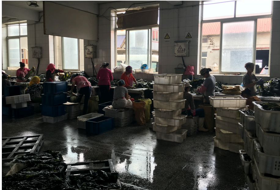
Image 7. Women Fishery Workers at the Tiansheng Fishery Company 20