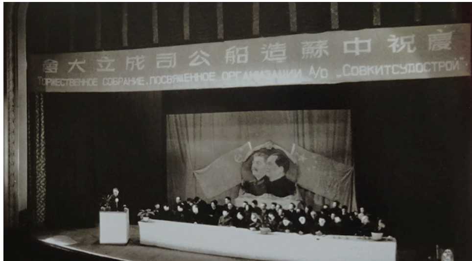
Image 2. The Establishment of the Sino-Soviet Shipbuilding Company 11

The Chinese SOEs enthusiastically adopted the Soviet approach to industrial management and organization. Between 1948 and 1952, the Lüda Shipbuilding and Repairing Company replaced the hour-rate wage system with the Soviet piece-rate wage system, imitating the one set up first in the Sino-Soviet Joint Fisheries Company in 1946. The company's records praised the new system as increasing worker enthusiasm and responsibility in production. The reports also noted that workers became dissatisfied with a large production team under the new system, where they suffered the consequences of their fellow workers' idleness. 12 In addition to the piece-rate wage system, the Lüda Fisheries Company also adopted the Soviet collective contract system in 1950. The collective contract offered workers economic incentives, while managing to reduce costs as it encouraged workers to save uses of