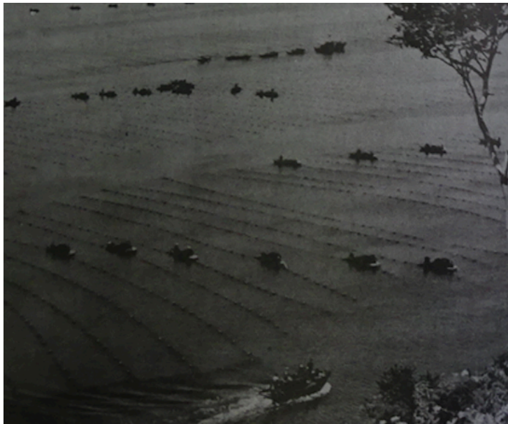
Image 4. Marine Aquaculture in Dalian 58

prejudices against eating it. 56 In addition to the rising domestic value of fishery products, the export of these products helped pay for industrial imports from the Soviet Union. In 1959, one ton of frozen fish was worth two tons of steel, and one ton of shrimp was worth six tons of steel. Small dry shrimp called xiami were worth even more: one ton could buy 9.5 tons of steel. 57