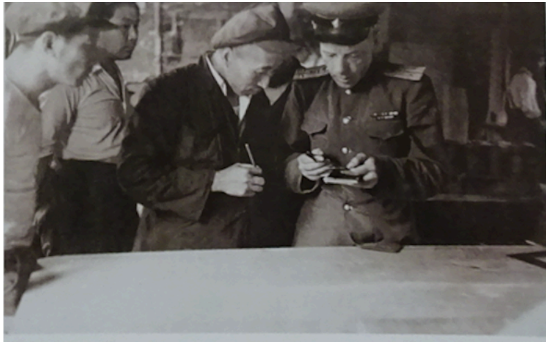
Image 3. “Chinese and Soviet Experts to Conquer Technical Difficulties Together” 15

different from the one common in pre-1949 factories, as the state in the 1950s itself took over the task of hiring and training new workers with the aid of the experienced, senior workers.