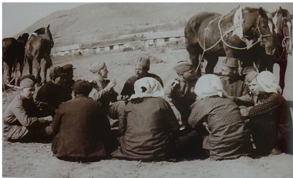
Image 1. The Soviet Soldiers in rural Dalian 40

Confronted with Soviet disapproval, the municipal Party committee stayed supportive of the party line of “putting the Soviets first.” 41 In contrast, cadres in the villages openly denounced the Soviet officers. As one said at the time, “I think the Soviets were following the landlord line and I hated them...They ordered us to return confiscated land to landlords, but I disagreed. If we do that, the landlords will rise again...They humiliated us in front of the villagers. I lost face and it is difficult to continue to do my job.” 42 In practice, the village cadres carried out the rent reduction movement secretly. They “pretended not to know until the Soviets found out” or concluded that “it did not matter whether the Soviets would find out.” 43