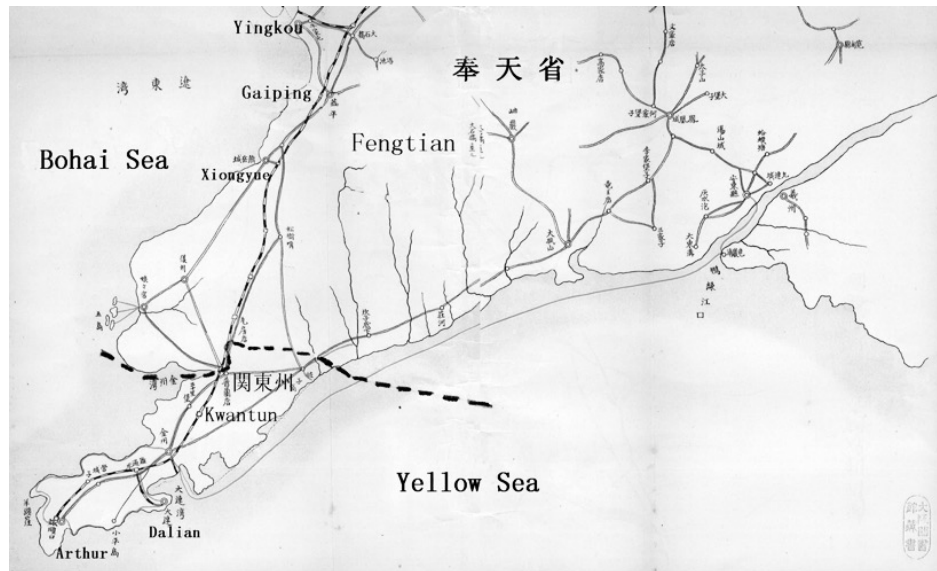
Map 1. The Guangdong Leased Territory and Fengtian Province 30

Before the arrival of Japanese fishermen, Chinese fishermen had a long history of living and working in the coastal areas of the Bohai Bay. The author of Manshū no suisan jijō noted that since the Tang Dynasty (AD 618-907), Chinese fishermen had migrated from today's Dengzhou in Shandong province to the Liaodong Peninsula in Manchuria. 31 In addition to traditional fishing households, fishing was also an important subsidiary business for many Chinese farmers in southern Manchuria. The majority of Chinese fisheries in this region operated in the fishing grounds close to shore, depending on traditional methods such as set nets, long lines and ground nets. 32 In the early half of the twentieth century, there were over thirteen thousand Chinese fishermen working in Dalian. As a result of the sheer size of the population gap