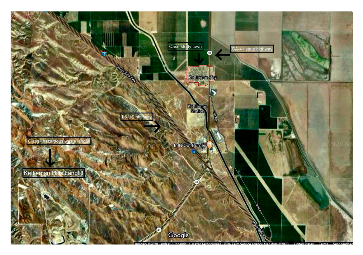
Figure 1. Satellite imagery of Kettleman City showing the community, two intersecting highways surrounded by agricultural land and hazardous waste landfill, Kettleman Hills (imagery from Landsat/Copernicus, Mazar Technologies, U.S. Department of Agriculture Farm Service Agency (2020) accessed via Google Maps at a scale of 2000 feet).

This study is funded as a pilot project by the UC Davis Environmental Health Sciences Core Center (EHS CC P30ES023513; EHSC), a Core Center funded by the National Institutes of Environmental Health Sciences (NIEHS) of the U.S. NIH. Similar to other kinds of national public funding for research, the NIEHS funds Core Centers to centralize scientific resources and facilities to advance scientific research, facilitate team science, promote community engagement, advance translational research, and support future researchers [51]. Each center has an overall strategic research vision and includes four cores: Administrative, Integrated Health Sciences Facility Core, Community Engagement Core, and other optional cores [51]. To understand residents' risk to multiple sources of pollution and social vulnerability, a community-based transdisciplinary approach was necessary to conduct this research.