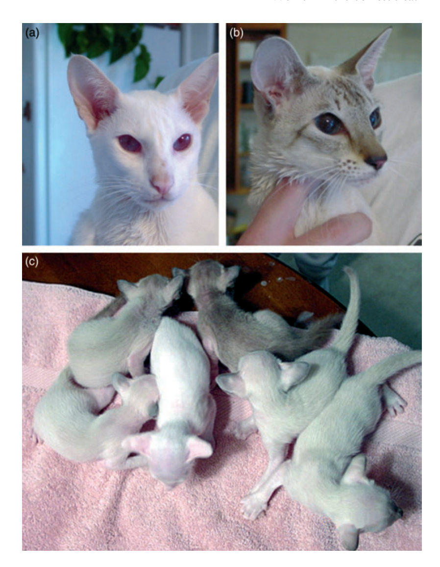
Figure 2 Phenotypes in a domestic cat pedigree (Fig. 1) that segregated for albinism: (a) albino, (b) a Colourpoint (chocolate lynx-point non-albino) sibling; and c) a litter of kittens that includes an albino (third from the left).

and assist with breeding programmes. This finding also supports the use of the cat as a model for human TYR -associated albinisms.