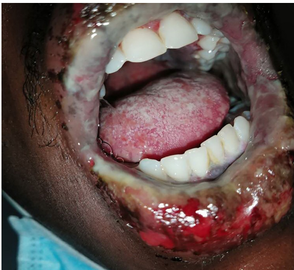
Image 2. Severe stomatitis with diffuse ulcerations.

SJS is part of a spectrum of mucocutaneous diseases affecting the skin and mucous membranes, which include erythema multiforme minor, SJS (erythema multiforme major), and toxic epidermal necrolysis. 5 Skin involvement occurs in more than 90% of patients, but the appearance of skin lesions can vary from targetoid to diffuse erythema. 6 Mucosal lesions typically occur at multiple sites such as the mouth, eyes, or genitalia. In adults, medications such as aromatic antiepileptics, allopurinol, sulfonamides, and nonsteroidal anti-inflammatory drugs are the most common precipitants. 5,6 Bacterial and viral infections are the most commonly identified cause in children,