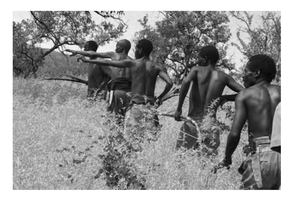
FIGURE 10.3. A group of Hadza men cooperatively hunting zebra.