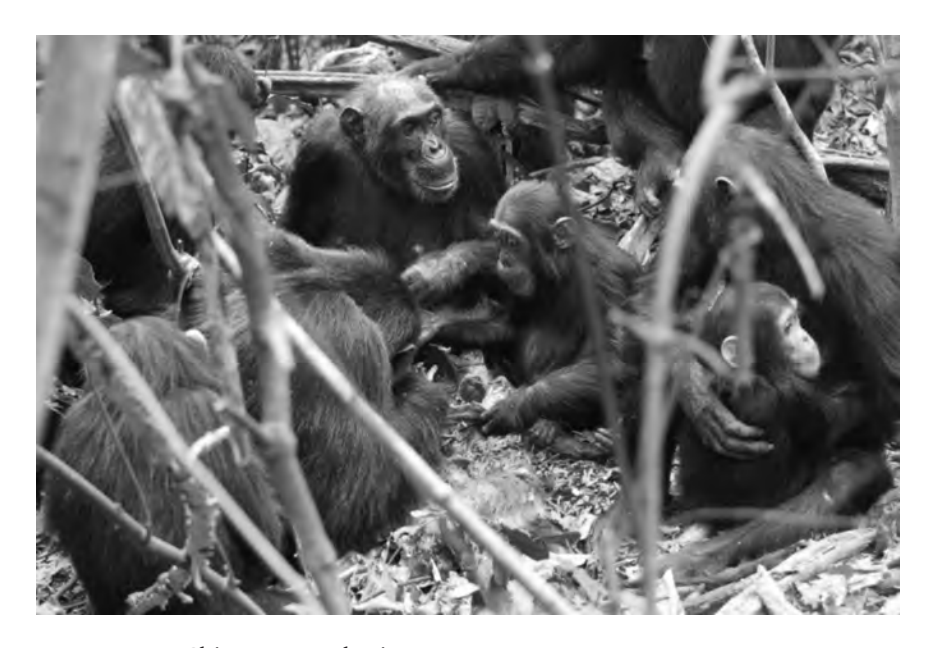
FIGURE 10.4. Chimpanzees sharing meat.

more likely to occur if the recipient had groomed the donor within the preceding ninety minutes than if no grooming had occurred. Although the effect was rather small, these exchanges were partner-specific, and there was some evidence of turn-taking.