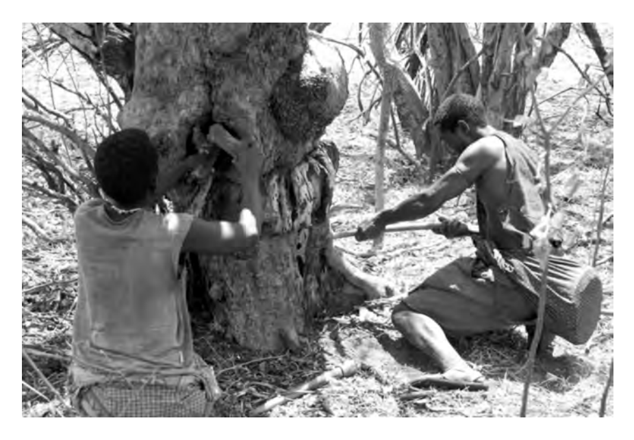
FIGURE 10.5. A Hadza couple cooperatively hunting a hyrax—the wife blocking possible points of escape while her husband spears the animal.

okapi, giant forest hog, and bushpig (Harako 1981). Hadza men use it to shoot zebra, eland, buffalo, impala, and smaller game. This is a very effective strategy for the Hadza in the late dry season, when animal movements are more predictable, and while hunting at night (Hawkes et al. 2001b). Ju / 'hoansi men also occasionally hunt at night from blinds (Lee 1979).