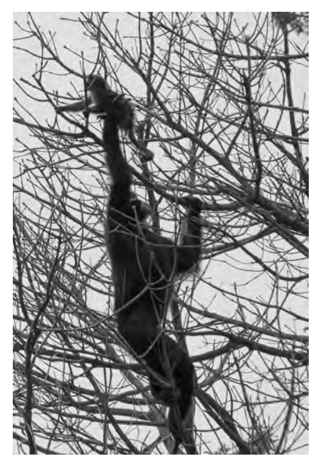
FIGURE 10.1. A chimpanzee at Gombe National Park captures a juvenile red colobus monkey.

one of the exceptions in Goodall's (1986) sample was "estimated at just over half adult size," suggesting it weighed at least 25 kg (Kingdon 1997).