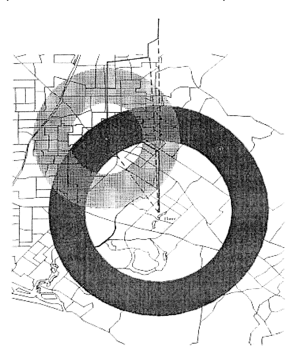
Figure 2 Simulation of Activity Destination