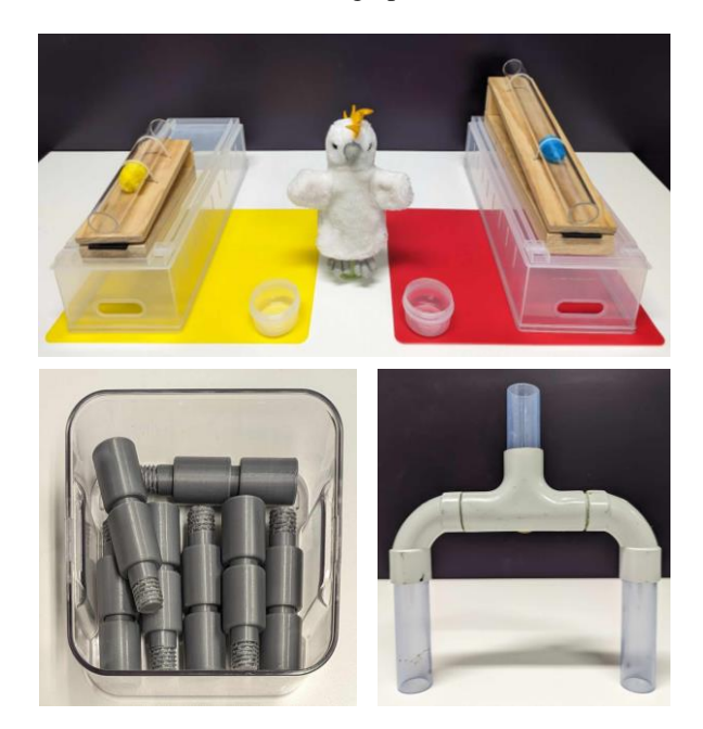
Figure 2. Top: tool construction task. Bottom left: dowel pieces for tool task. Bottom right: forked tube apparatus.

sized diagonal tube apparatuses (1x40cm tube, 2x20cm tubes) were set up across the two mats. The 40cm apparatus was positioned on the red mat and the two 20cm apparatuses on the yellow mat, although only one 20cm apparatus was in view at any one time (see Figure 2). Each apparatus consisted of clear PVC tubing connected to a right-angled triangular wooden base. Located inside each of the tubes was one fabric 'pom-pom' ball. The apparatuses sat atop a transparent container which also acted as a cover for the yellow mat apparatuses while an opaque, black container was used as a cover for the red mat task. Seven connectable dowel pieces (see Figure 2) could be combined to build a tool to dislodge the ball from the tubes if enough piece were connected.