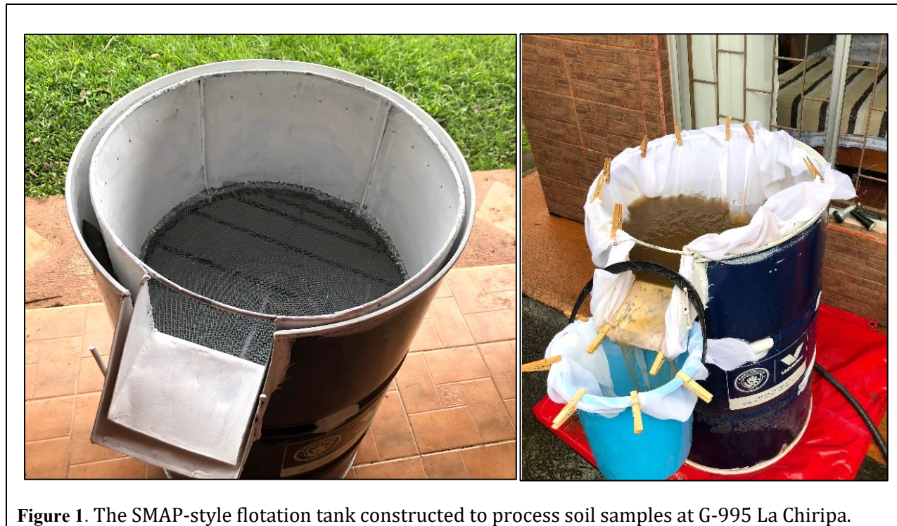
Figure 1. The SMAP-style flotation tank constructed to process soil samples at G-995 La Chiripa.

To gather data, I constructed a machine assisted flotation system that used pressurized water flow (tap pressure) to agitate the soil matrix within water. This machine was a SMAP-style water flotation tank (Figure 1) and allows for a detailed recovery of any organic materials preserved below the surface. Water flows continuously into the 55-gallon tank via a hose connected to a water tap. The water exits directly beneath the heavy fraction basket, which was lined with a mesh screen. Water exits the tank as overflow into a light fraction bucket, whose bottom is also lined with mesh screen material. Because a mesh screen fine enough for a detailed recovery was not obtainable in Tilaran, mesh cloth (0.2 mm opening) was placed both in the light fraction collection bucket and the inner basket of the tank for the heavy fraction. Any organic material within the soil samples placed into the inner basket will float up to the surface and exit the top opening and will be collected in the mesh fabric lining the light fraction bucket.