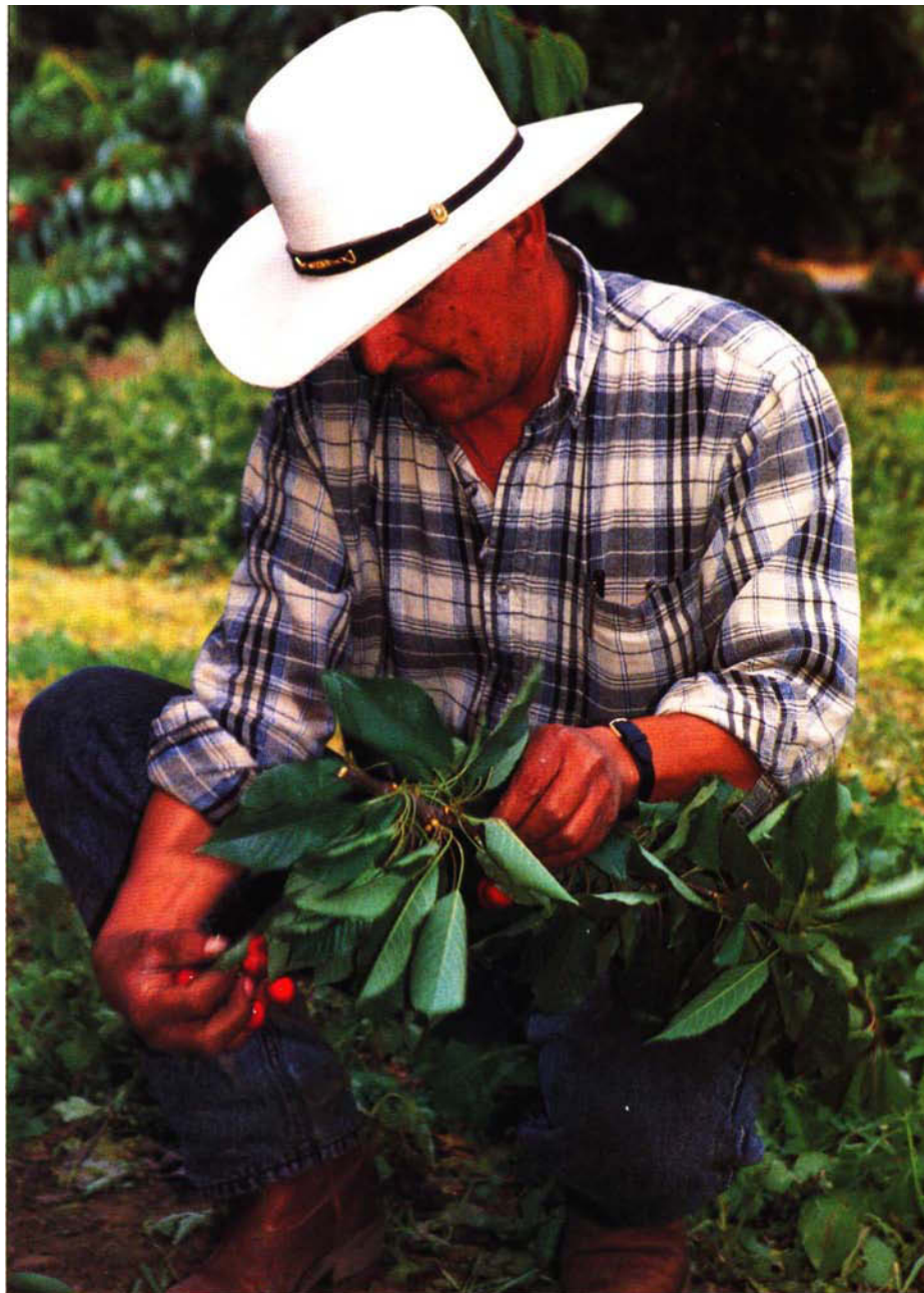
When identifying the most challenging and rewarding aspects of their positions, farm supervisors overwhelmingly selected their relations with people.

Those in upper management were six times more likely to fire an employee (85%) than first-line supervisors (14%). Respondents recalled having fired the last person as long as 44 years ago and as recently as 2 weeks ago, with an average of a little over 10 years since the last termination. Considering that the average time working as a supervisor was 14 years, it is clear that farm employees are not often terminated. In several instances the distinction between the employees being fired or quitting was blurred, as was the distinction between being fired or simply not rehired the next season. With the exception of two instances,