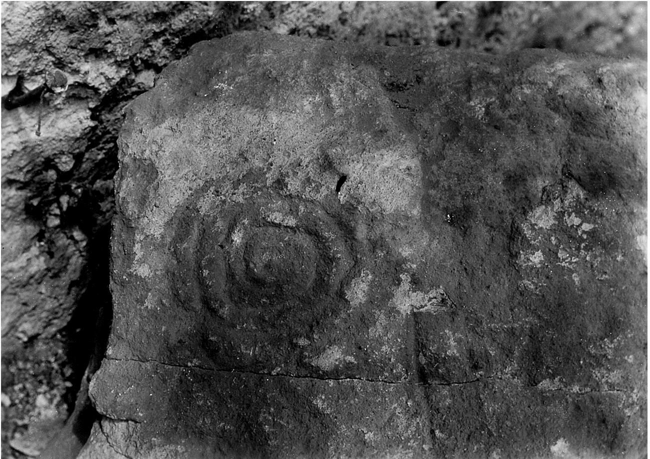
Figure 3. Historic photograph of the spiral petroglyph from Etna Cave. (Courtesy of the Braun Research Library, Autry National Center of the American West, Los Angeles; Photo #23541).

this print reads “Petroglyph on rock from Etna Cave deposit. Rock brought to SWM.” The catalogue record for the photograph indicates that this piece relates to the 1937 expedition. Although apparently transported to the Southwest Museum, there is no catalogue record for this object and museum records indicate that it was not located during a 1987 inventory of rock art in the collections. Still, if the caption is correct—and this seems likely given that excavated matrix is visible in the photograph—this photograph provides additional evidence of rock art at Etna Cave that once again escaped inclusion in Wheeler’s (1942) report.