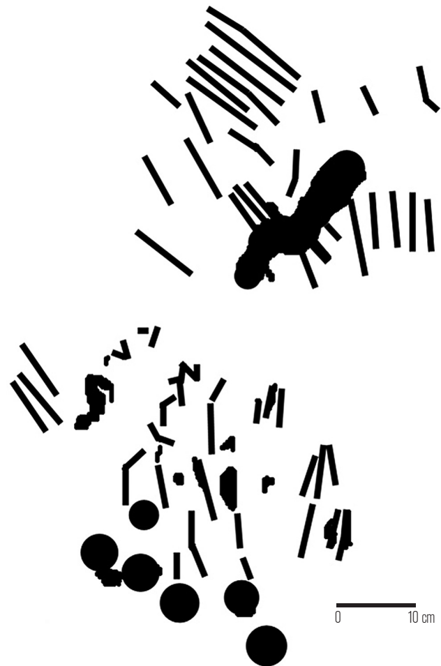
Figure 4. Schematic depiction of pictograph panel inside Etna Cave.

The lower portion of the pictograph panel—below a natural crack that bisects the panel from upper left to lower right—consists of a series of less distinct linear or geometric applications of paint (Fig. 4). These include an array of six roughly circular dots 7 cm. in diameter in the lowermost portion of the panel and at least six elongate, striped or solid, roughly vertical areas of paint ranging from 8 to 17 cm. in length and 3 to 6 cm. in width above the dots. The striping appears to have been produced by dragging three adjacent fingers across the rock to apply the paint. The elongate motifs are primarily oriented with the long axis just slightly right of vertical, although