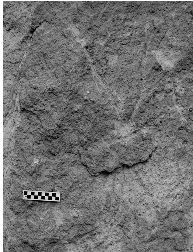
Figure 6. Scratched 'V' figure adjacent to Etna Cave.

support their indigenous authenticity. In form, at least two of the abstract curvilinear groups are reminiscent of the motifs found in the pictograph panel at nearby 26LN110, although the latter are much more elaborate.