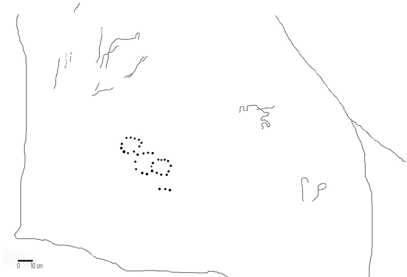
Figure 5. Schematic depiction of petroglyphs on the boulder outside of Etna Cave.

of the panel; thus, it may have been possible, although physically challenging, to complete the painting while standing on this elevated surface.