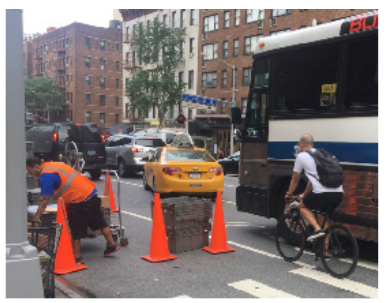
Figure 1. A cyclist navigates along a sharrow in New York City.

our study, some physically protected paths lacked any injuries at all," Wall and his research team wrote. "Their designs and use may be informative to improve bicycle route infrastructure in other locations where injury risk and severity are greater than expected." In other words, cities should look at where injuries haven't occurred to prevent where they do.