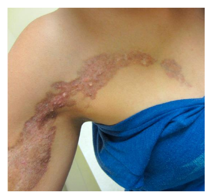
Figure 1 . Linear morphea and calcinosis cutis on the right shoulder and arm of a 12-year-old girl.

within the morphea plaques on the abdomen and legs. Intralesional sodium thiosulfate approximately one year prior had resulted in increased pain and ulceration.