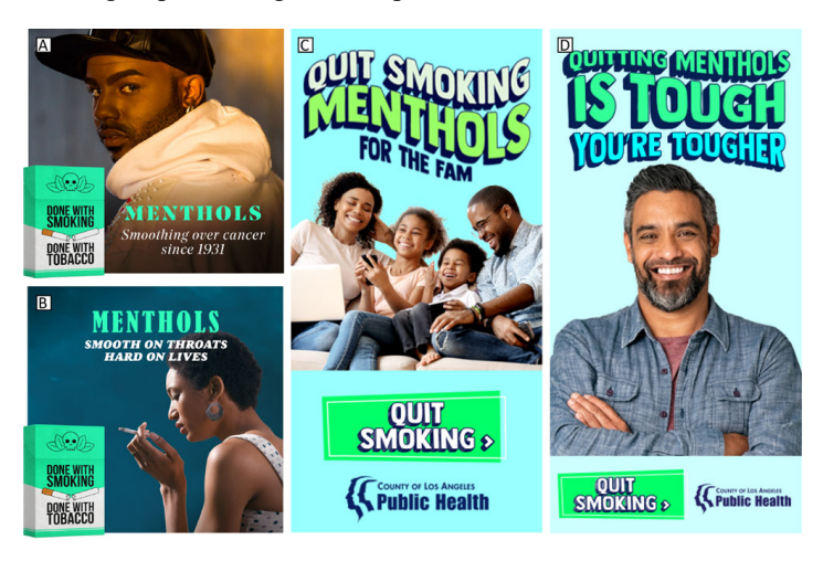
Figure 1. Los Angeles County Department of Public Health's health marketing campaign, "Done with Menthol." Photo A, "Menthols - Smoothing Over Cancer Since 1931"; photo B, "Menthols - Smooth on Throats Hard on Lives"; photo C, "Quit Smoking Menthols for the Fam"; and photo D, "Quitting Menthols is Tough, You're Tougher."

to specific audiences by way of radio station disc jockeys who are trusted community voices (Figure 2). Out-of-home ads were placed at convenience or liquor stores where people think of smoking or purchasing tobacco products.