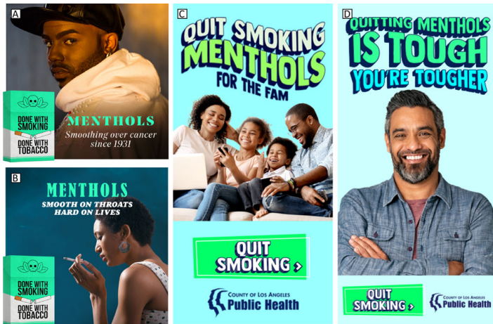
Figure 1. Los Angeles County Department of Public Health’s health marketing campaign, “Done with Menthol.” Photo A, “Menthols – Smoothing Over Cancer Since 1931”; photo B, “Menthols – Smooth on Throats Hard on Lives”; photo C, “Quit Smoking Menthols for the Fam”; and photo D, “Quitting Menthols is Tough, You’re Tougher.”

to specific audiences by way of radio station disc jockeys who are trusted community voices (Figure 2). Out-of-home ads were placed at convenience or liquor stores where people think of smoking or purchasing tobacco products.