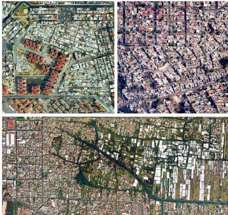
Fig. 9. Clashes. The image of Colonia Cabeza de Juárez IX at top left reveals the intrusion of centrally planned Unidades Habitacionales into a community of low-slung, self-built homes. Residents continue to protest against displacement, but the municipal government regards the area as ideal for high-density, automobile-oriented redevelopment. The conflict is readily discernible in the landscape as the two forms jostle for space. At top right, the rectilinear grid of Lomas deteriorates at its eastern edge, where it seems almost etched into the winding streets of Golondrinas. The collision of these distinct urban forms produces a complex and intricate series of parcel geographies that hug the contours of the steep hillside, resulting in a cascading foam of closely-packed, multilevel structures. At bottom, the dense urban fabric of the contemporary city marches inexorably toward the farms and canals of Xochimilco. Listed as a UNESCO World Heritage site, Xochimilco preserves the remnant form of the chinampas—woven reed beds floating atop the lake separated by an intricate network of canals. The chinampas once comprised the dominant urban form of the Mexico valley. However, the Spanish conquerors systematically drained the lakes to build the present city.