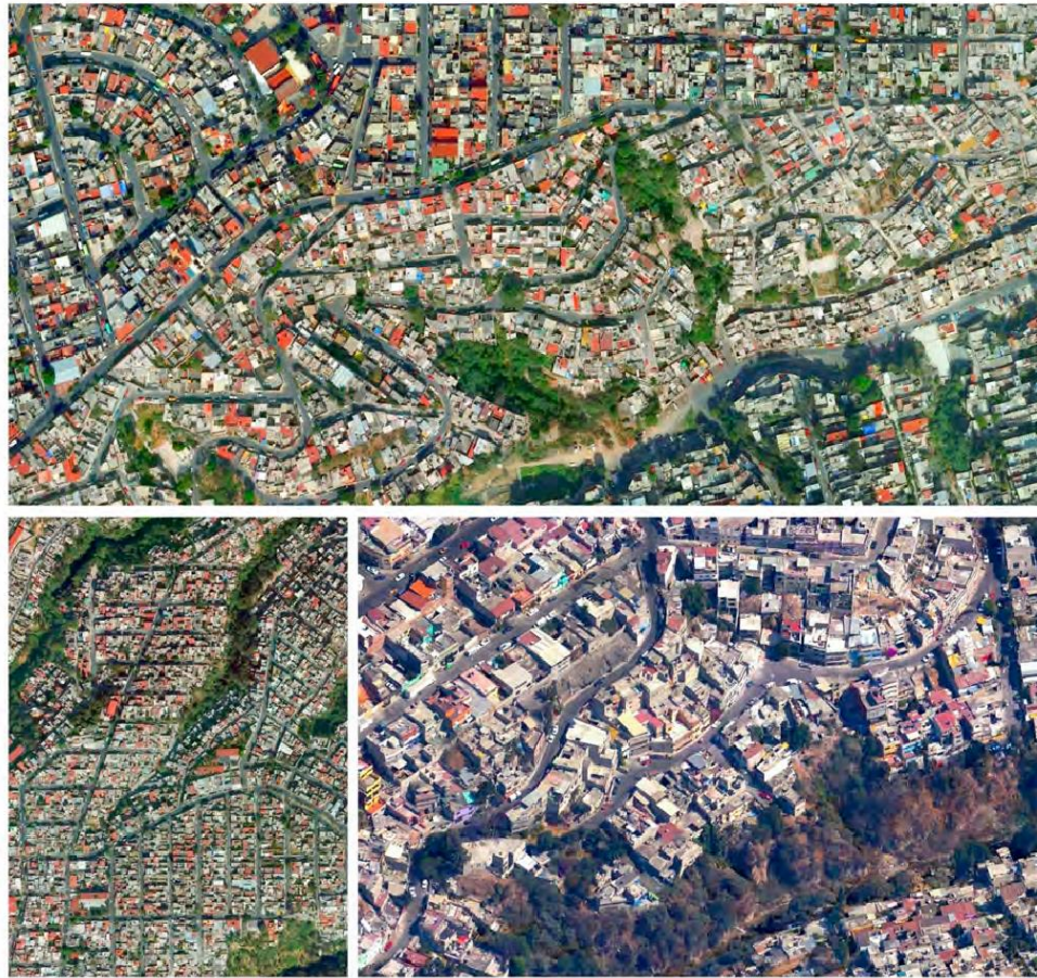
Fig. 7. Contours. When faced with significant topological barriers, city builders had to figure out strategies for extending the urban fabric. At top, the relatively ordered grid of colonia Presidentes ends where the folded forms of Piloto Adolfo López Mateos begin. At bottom right, houses and shops in working-class Piloto perch precariously on terraces sculpted into the sheer cliffs above Palmas creek. Very often the rooftop of one house meets the foundation of another as the neighborhood marches up the hillside. Streets wind along natural contours of the slope, tracing a topographical map of the barrio. An elaborate network of narrow staircases affords pedestrians vertical access between the long streets. Meanwhile, Presidentes, Lomas de Capúla, and other neighborhoods (bottom left) manage to retain gridded patterns, even if the aerial view obscures the often steeply graded streets. The grids persist right up to the edges of valley walls, at which point orthogonality dissipates into fractalated forms.