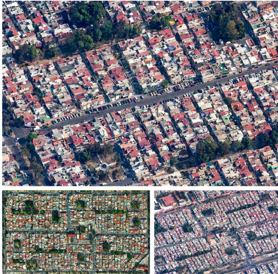
Fig. 5. Bounded grid, disrupted. In laying out the Colonia CTM Aragón, planners played with the grid form by breaking it up. Financed by the Confederation of Mexican Workers (CTM), the colonia reveals several design features unusual for Mexico City. A series of 16 linear and square green spaces ensure that most households have one within short distance. Residential stock is comprised predominantly of single-family townhouses rising two stories on modest footprints, with the space normally allotted to courtyards redistributed to the various green spaces. The central module contains a church, market, and schools. Streets afford limited ingress, and there is no way to traverse the colonia in an automobile. More unusual is the neighborhood's interior parking system, with vehicles restricted to designated thoroughfares, and many houses only accessible via narrow pedestrian walkways. These various features are reminiscent of the 'New Town in the City' planning approach of the 1960s and 1970s. While manifestly a grid, the urban morphology of the neighborhood also has a diagrammatic quality to it (see Figure 6 below).