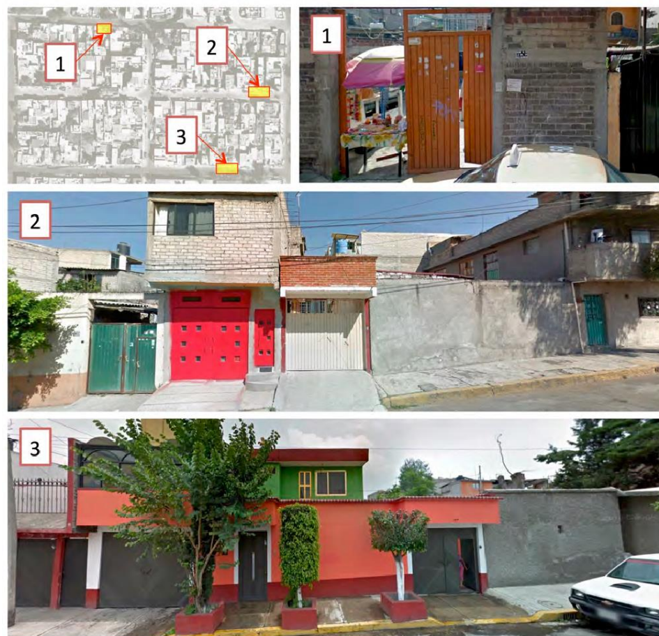
Fig. 1. Street walls obscure urban form. These Google Street View images show the street wall condition on Cacama (top), Acamapichtli (middle), and Ilhuicamina (bottom) in the Zona Urbana Ejidal los Reyes Culhuacan. While by no means uniform, the walls, gates, and garage doors that line the typical street nevertheless mask the complexity of parcel geographies, the relations of houses to courtyards, the interior block circulations, and the uses of land. Some properties present a residential façade to the street, where others present garages or courtyard walls. Many residents use courtyards and passageways as workshops, storage, production facilities, and retail outlets for small businesses. The complexity of the city's morphology cannot be deduced from the ground level alone.

detail afforded through aerial photographs, tools such as Google Earth provide an undeniably useful source for urbanists to study city form and metropolitan expansion. The vertical view is particularly valuable for its capacity to illuminate spatial relations that are otherwise difficult to trace on the ground, but which nonetheless organize everyday human experience (Kropf 2009 105-120). For example, in Mexico City uniform street walls often conceal complex parcel geographies, while buildings packed around a block perimeter give no hint of the multiple structures, passages, and courtyards that recede into the interior of the block (Figure 1). To be sure, spatial syntax and shape grammar neither determine human behavior nor reflect cultural proclivities in any straightforward way. However, urban morphologies certainly frame the ways in which social relations materialize, simultaneously enabling and constraining mobility, encounter, exchange, and habitat (Hillier 41-60, Griffiths 157-159).