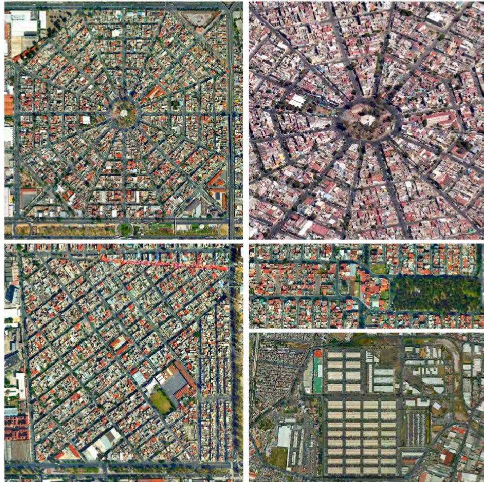
Fig. 6. Diagrams. The spider web of Colonia Federal (top left and right) converges on a central plaza with playgrounds, small football ring, and cultural center. Though rigorously octagonal in plan, the 16 streets at the center resolve into a variety of land uses and architectural expressions. At lower left, the grid of Constitución de la República is at such odds with the surrounding morphologies that it seems to be inserted from another city altogether. The multiple angles result in many oddly shaped parcel geographies around the periphery. For the central juncture of the colonia Paseos de Churubusco (center right), planners resolved the misalignment between east and west sides with a chamfered rectangular block articulated to effect a graceful curve. And the immense circuit board that is Central de Abasto (bottom right) occupies 328 hectares on the city's east side. Designed by Abraham Zabludovsky and completed in 1982, Abasto is the city's principal wholesale food market.