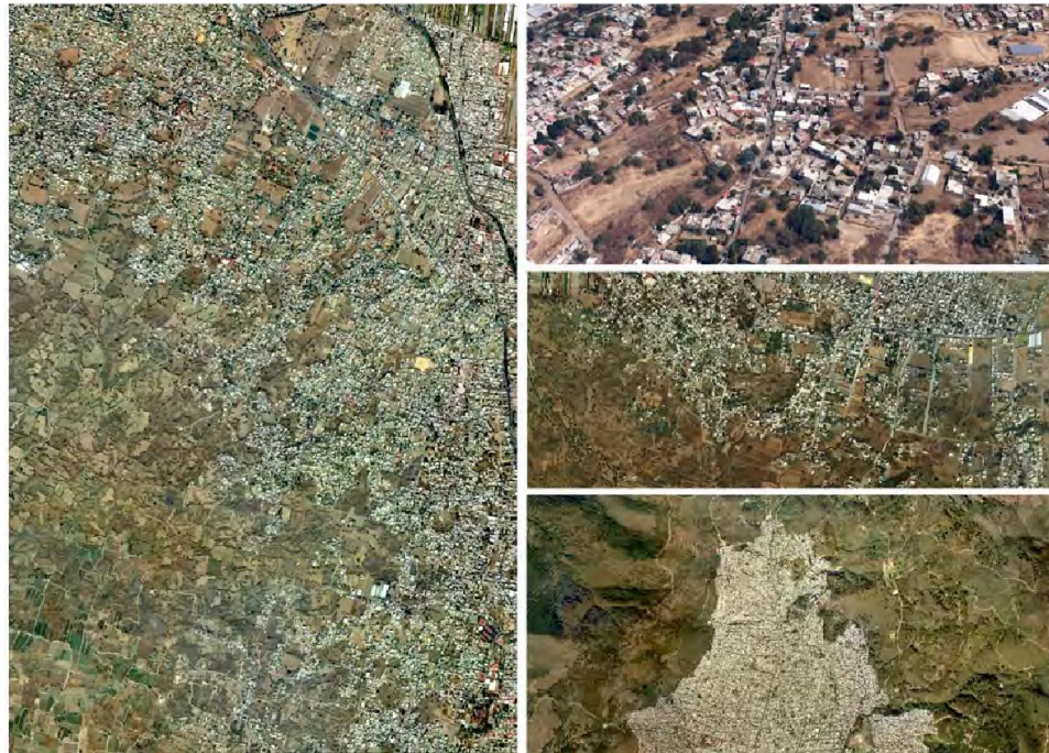
Fig. 10. Tendrils. These images reveal the shape of the city as a work in progress. At left, the urban footprint reaches into the agricultural hinterlands at the southern extreme of the metropolis, just west of the Camino Real. On the right (top), the small barrio of San Juan Minas takes shape south of Route 113. The built environment comprises a mix of urban and rural land uses, part barrio and part village, part metropolitan part agricultural. Clusters of small buildings spring up along the main streets, interspersed with houses on larger plots and open scrubland. In the center right image, the colonias of San Juan Tezompa and La Luz encroach on farmland; while located just outside of the D.F. in the State of Mexico, these communities are part of the ever-expanding conurbation. Malacates, shown at bottom right, is officially the northernmost point of Mexico City. It appears less like tendrils than a cascade of settlement climbing the hills as far as it can reach. The uniformly bright grey color of Malacates reveals an emergent neighborhood, where concrete block construction and its attendant dust coat the environment. The character of these precincts reveals the city as an always unfinished proposition, constantly being made and remade by the people who live there.