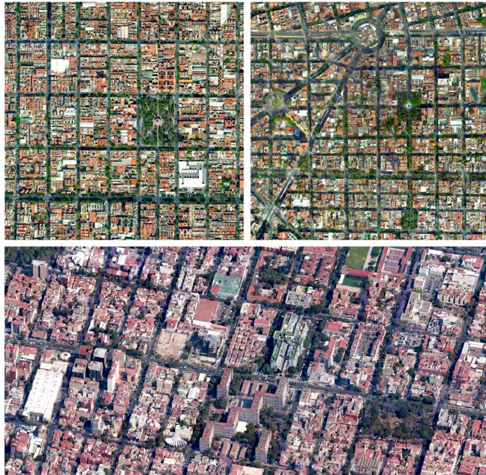
Fig. 4. Bounded grids. At top left, Santa María La Ribera is a late 19th century neighborhood carved out of an old hacienda, one of the first planned subdivisions outside of the Centro Historico. The dense residential fabric is composed primarily of large townhouses and courtyard buildings, many of which have been subdivided into vecindads (apartments). Colonia Roma (top right) presents a classic bourgeois urban landscape, built up in the early 20th century on former haciendas south of the center. The two round plazas were created during the massive reconstruction of the roadways in the 1920s and 1930s. In the bottom image, Colonia del Valle Centro was laid out in phases from the 1940s. The entire valley evinces a highly regular grid form with no discernible center. The colonia features a mixed residential stock comprised of townhouses on small lots and large apartment buildings of three to ten stories. The stair-step shaped complex is the Centro Urbano Presidente Alemán, a unidad habitacional designed by Mario Pani in 1947, and one of the first Corbusien-style projects built in the D.F.