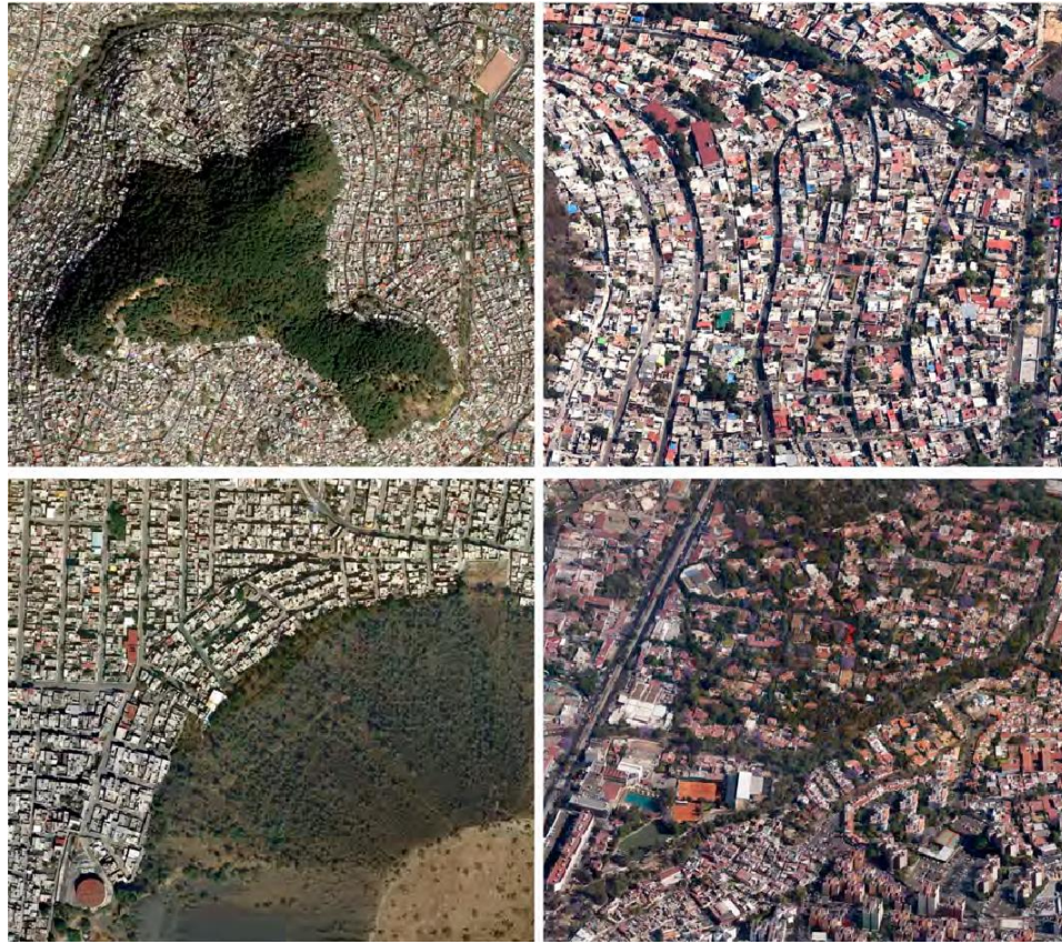
Fig. 8. Contours. The Cerro del Judio (top left), is an ecological reserve in the south of the city. The peak of the mountain can be seen in the center of the reserve, while the Rio Hidalgo traces the base to the north and west. Since the 1970s, new barrios have sprung up all around the park, with streets contoured along the topography of the mountain, creating gyres and eddies of built landscape. One of these barrios, El Tanque, can be seen at top right. El Tanque folds in ribbons around the Cerro del Judio with a series of eight contoured terraces that step steeply downward to the northeast. Each terrace level brackets a long undulating street lined with houses and shops. Many of the smaller streets that climb the slope are only one or two blocks long, so walkers and traffic must zigzag circuitously to climb or descend through the barrio. By contrast, the slopes of Xaltepec volcano (bottom left) prove too steep for building, so residents have wrapped the colonia San José Buenavista around the base of the cone. Following a watercourse rather than mountain terrain, the Avenida de Paseo (bottom right) runs on top of the Churubusco river, revealing one of the few remnants of the water's path. Massive Avenida Insurgentes, seen at far left, presents a dramatic contrast to the curvilinear Paseo.