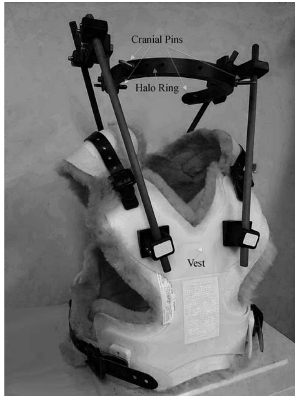
Fig. 3 An assembled Halo Ring and Vest that was utilized for our patient. White arrows point out cranial pin sites, the halo ring, and the vest components. (This Halo Vest is a registered product of PMR Corporation, MN, USA).