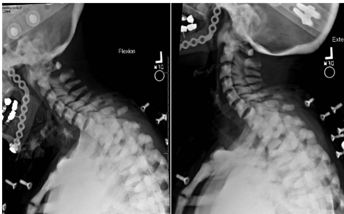
Fig. 4 Cervical spine flexion and extension radiographs. Cervical spine flexion (left) and extension (right) radiographs at 4 months after initial injury after removal of Halo vest showing minimal anterolisthesis between C6–C7 without any signs of gross instability.