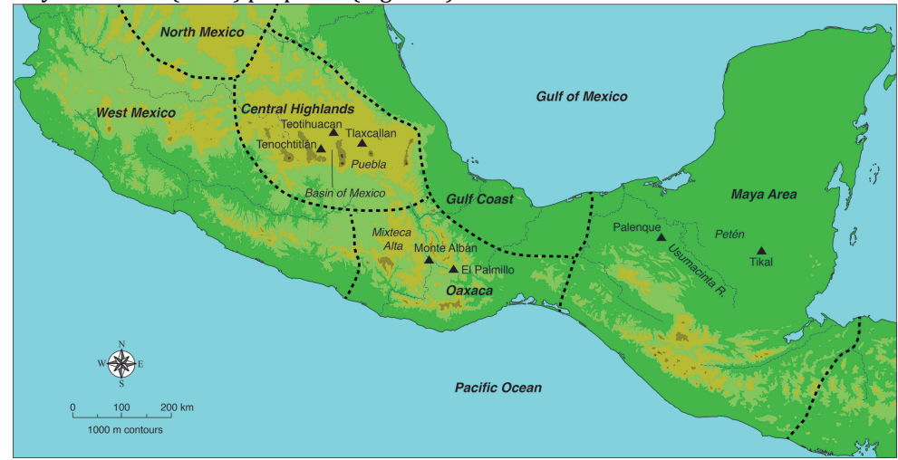
Figure 1. Map of Mesoamerica showing sites and places mentioned in the text.

ways that Wolf (1959) proposed (Figure 1).