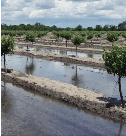
Figure 3. Orchard border irrigation.