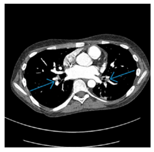
Image 1. Computed tomography pulmonary angiogram demonstrating pulmonary emboli in the right middle lobe and left upper lobe (blue arrows).

Approximately 2½ hours after morphine administration, the patient reported improved pain; however, his oxygen saturation decreased intermittently to 75% and improved to 95% with 1 L per minute of oxygen via nasal cannula. Upon reexamination by a second clinician, the patient's heart rate was noted to have increased to 100 BPM at rest despite improved pain control. A chest radiograph demonstrated mild perihilar interstitial opacities and central pulmonary vascular congestion. Due to continued intermittent desaturations to 75%, tachycardia, and prothrombotic risk factors of ALL and immobility, a computed tomography