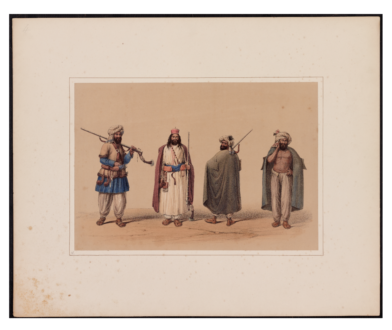
Figure 2: Kaukers of the Bolan Range, CC by UMN