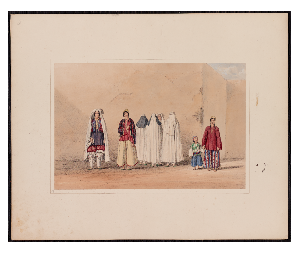
Figure 4: Cabul, Affghan and Kuzzilbash Ladies