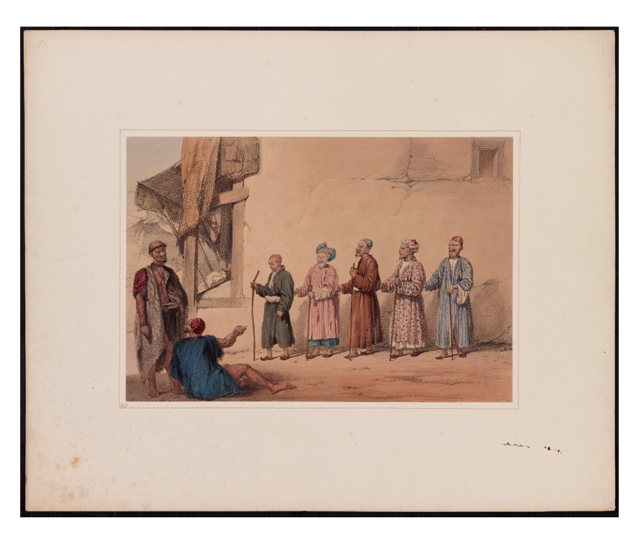
Figure 5: Cabul, A "Kuttar" or String of Blind Beggars CC by UMN