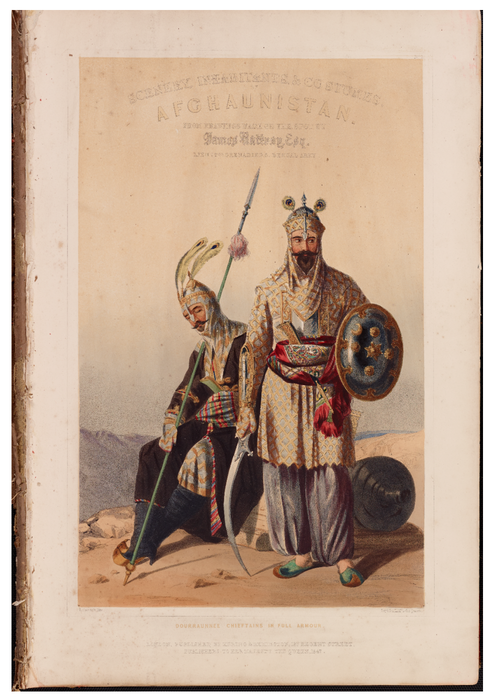
Figure 6: Dourraunnee Chieftains in Full Armour CC by UMN