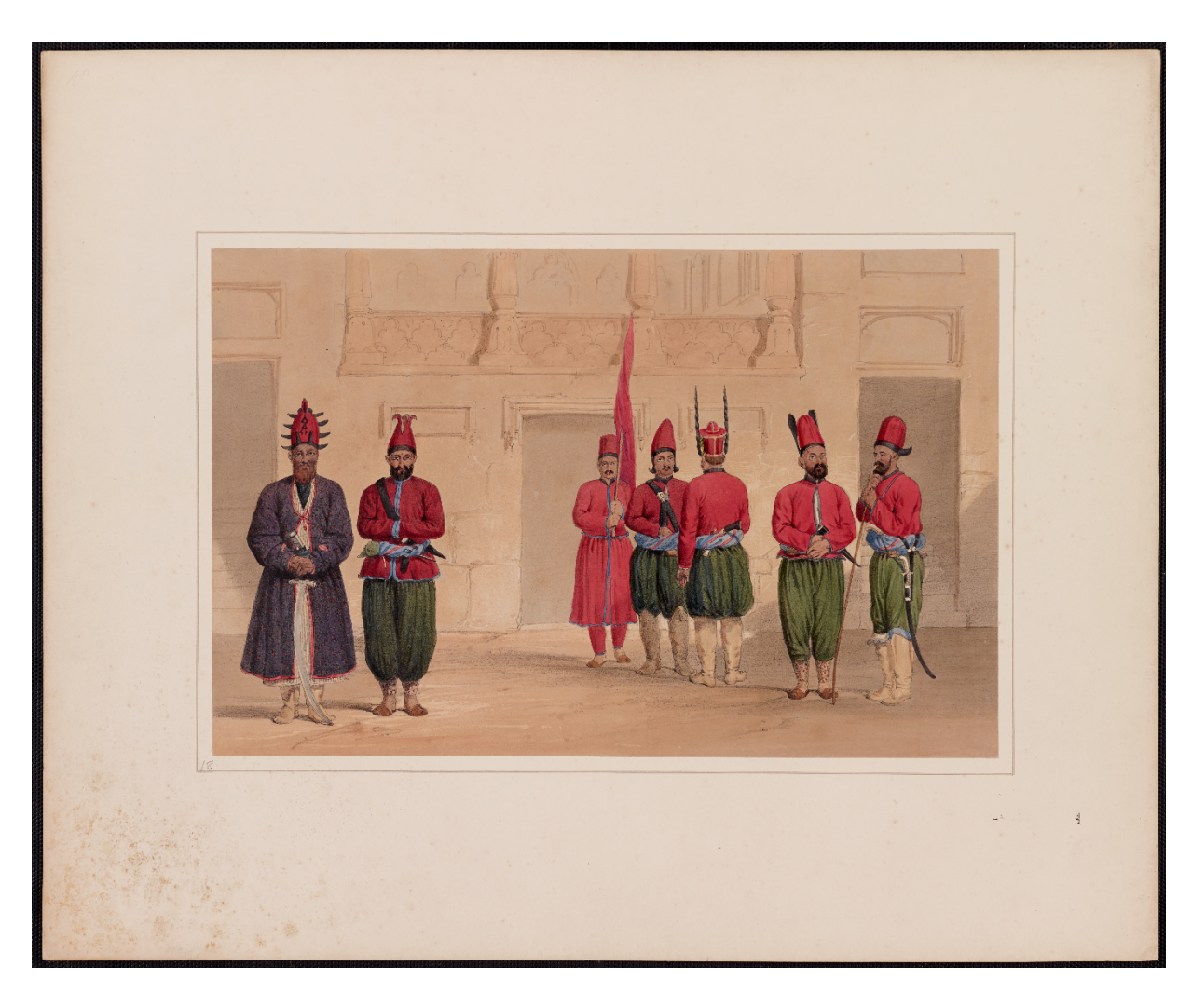
Figure 3: Cabul-Retinue of Shah Shoojau Ool Moolk-Mahomed Shah Giljee, Chief Executioner, Ghufoor, a Mutilator