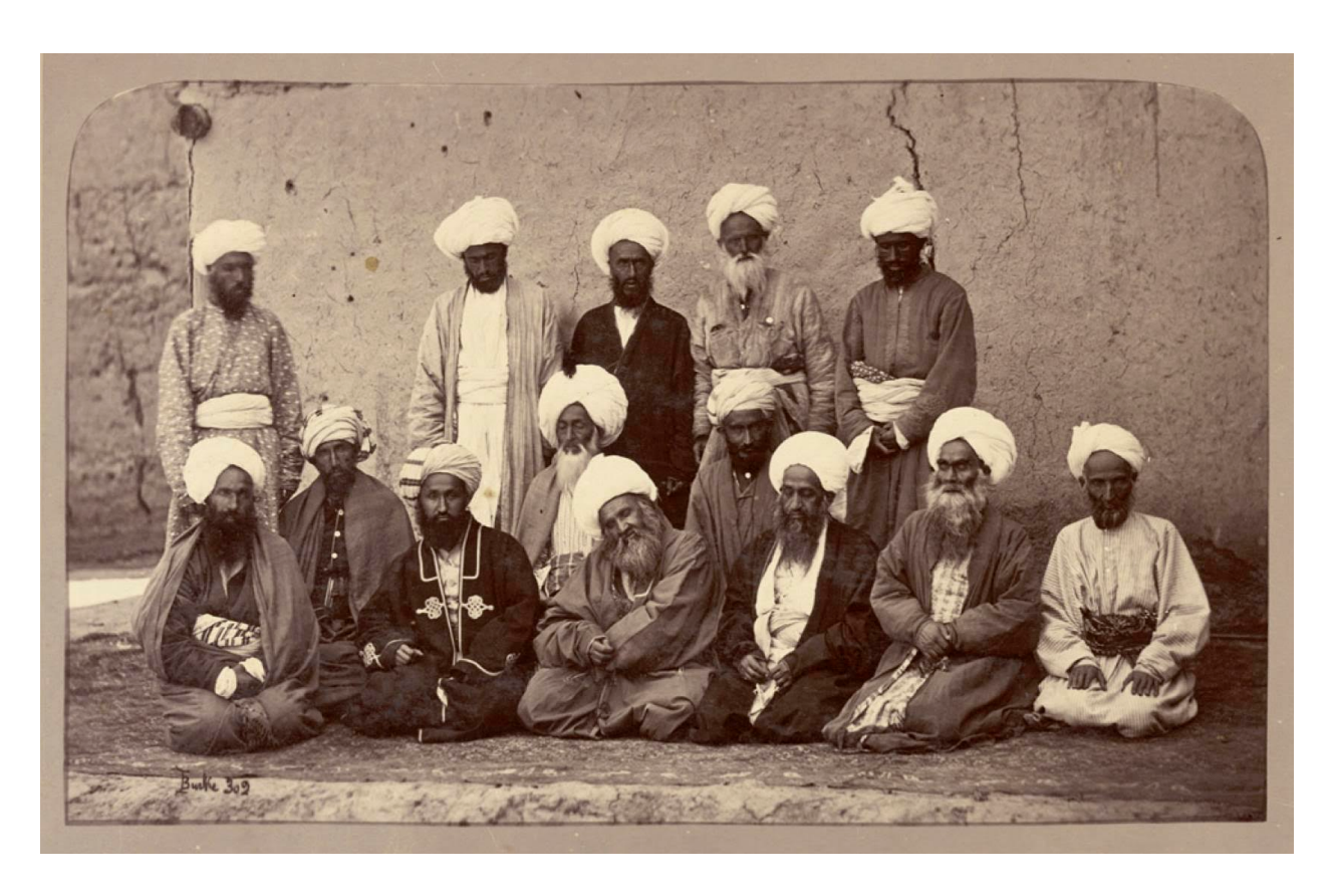
Figure 7: The High priests and moolahs of Kabul Photo 430/3(61)