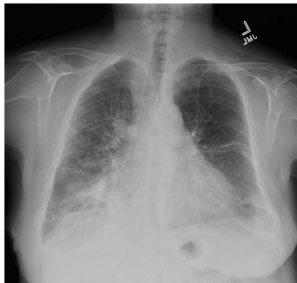
Figure 1 – Chest radiograph shows an ill-defined right peri or infra-hilar density, a right-sided reticulonodular opacities, and a bilateral small pleural effusions.

The patient appeared to be her stated age, well-nourished, and comfortable at rest on 4 L oxygen. Her vital signs were as follows: temperature, 36.4°C; pulse, 81