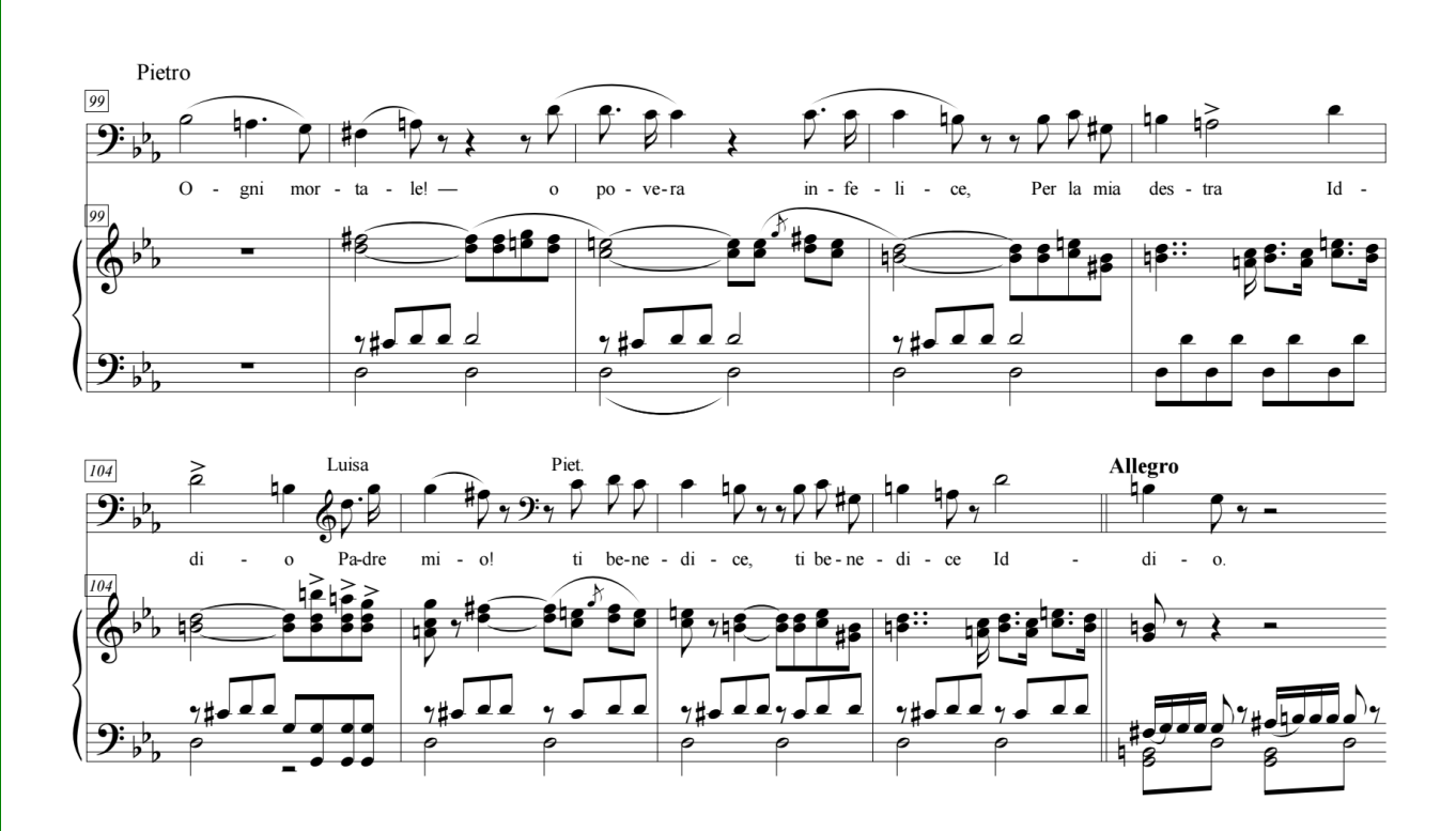
Example 5. Paniagua, Pietro d'Abano , Nr. 5, sc. 4 (Recit. Pietro), mm. 99-108.