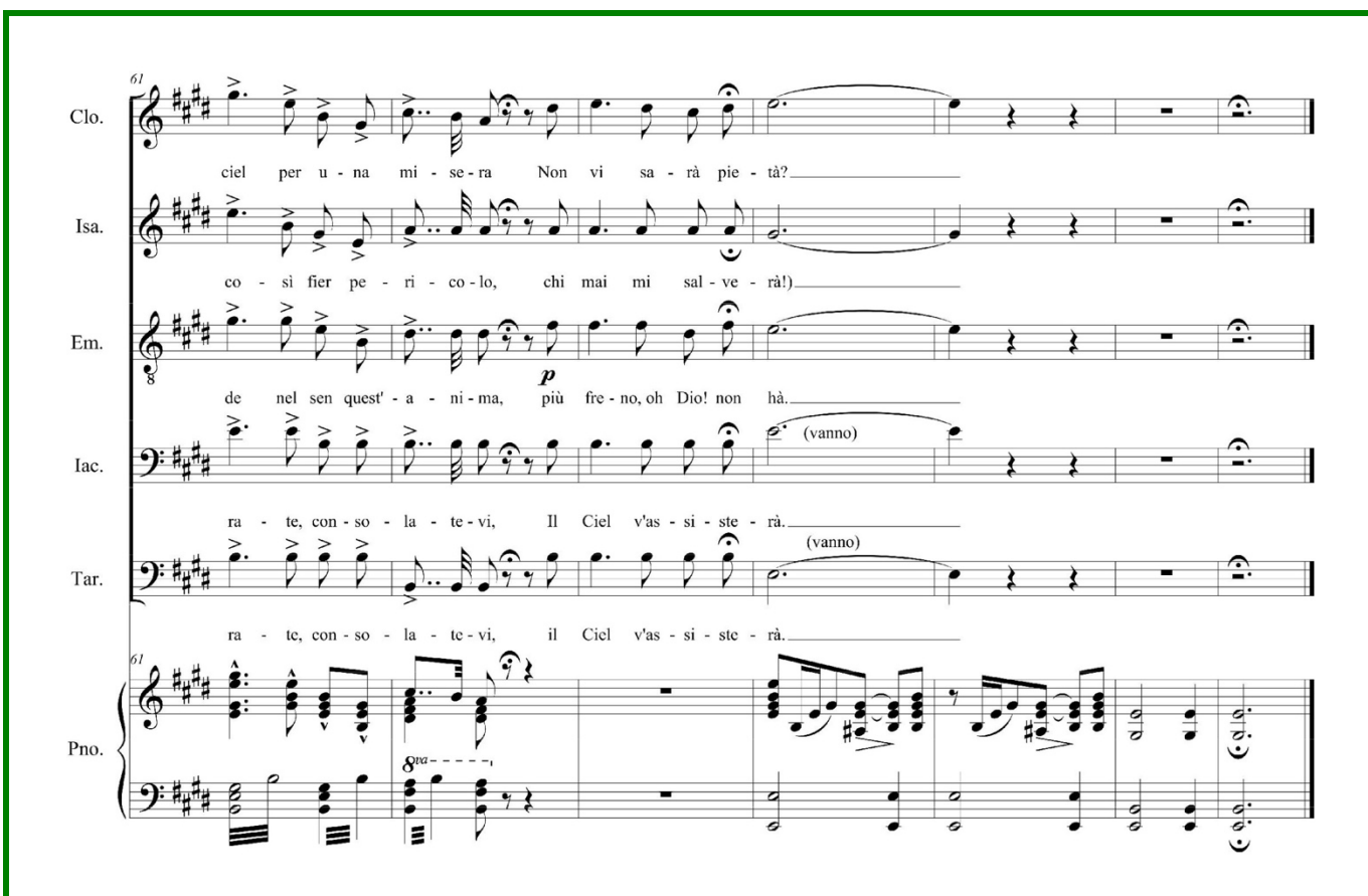
Example 11c. Valle, Clotilde di Cosenza, act III, sc. 9 (Quintetto), mm. 61-67.

La Spina, Riccardo. "Ecco il loco destinato": Cenobio Paniagua, the New Composer and Original Opera as an Expression of National Pride in 1863 Mexico. Diagonal: An Ibero-American Music Review 9, no. 2 (2024): 78–128.