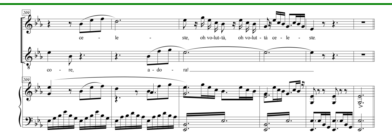
Example 8. Paniagua, Pietro d'Abano, Nr. 5, sc. 5 (Barcarolle/serenade Arnoldo/Luisa), mm. 199-214.