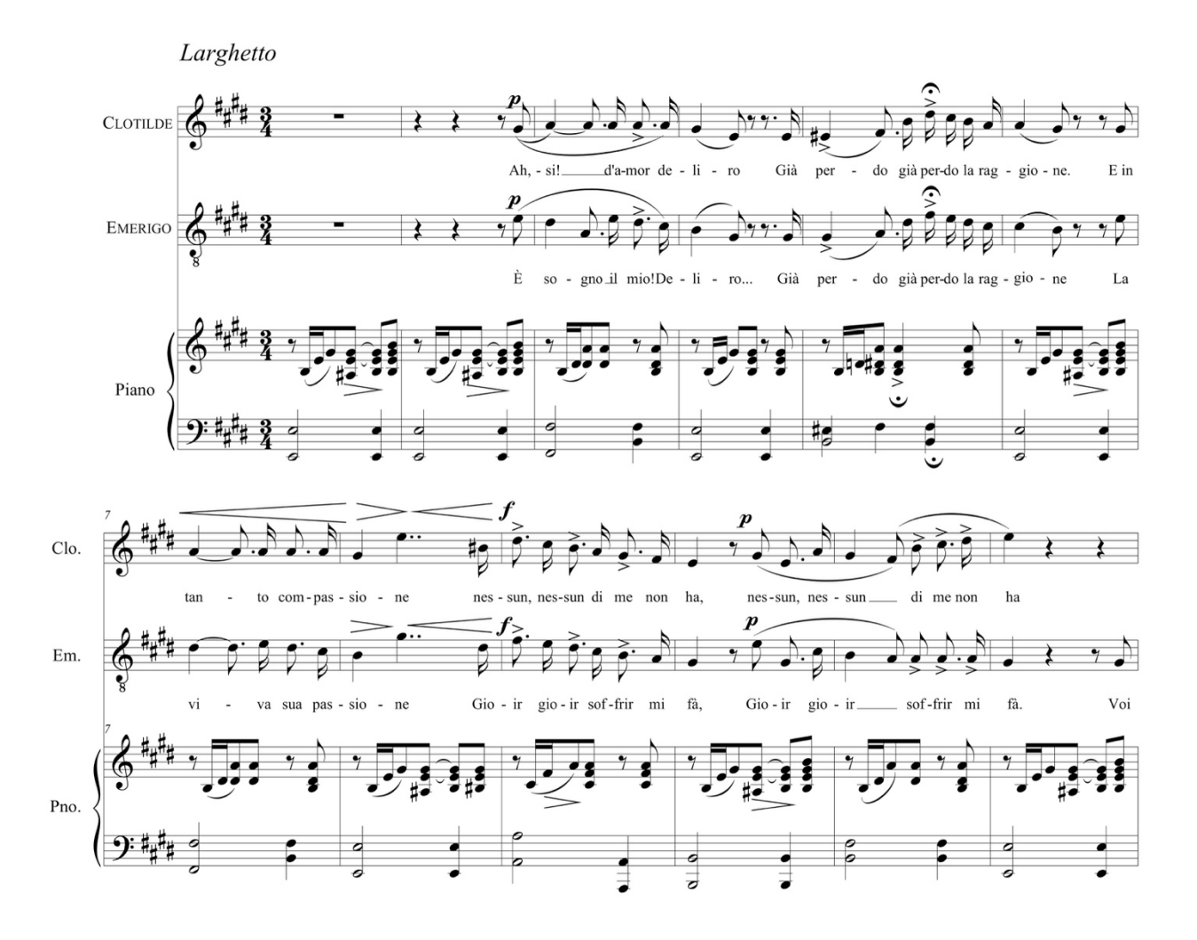
Example 9. Valle, Clotilde di Cosenza, act III, sc. 9 (Quintetto), mm. 1-12.