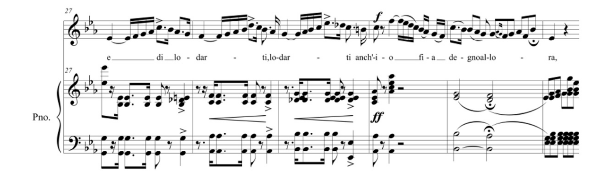
Example 2. Paniagua, Preghiera – Vergine Santa e Pura, mm. 21-32 (beat 2).