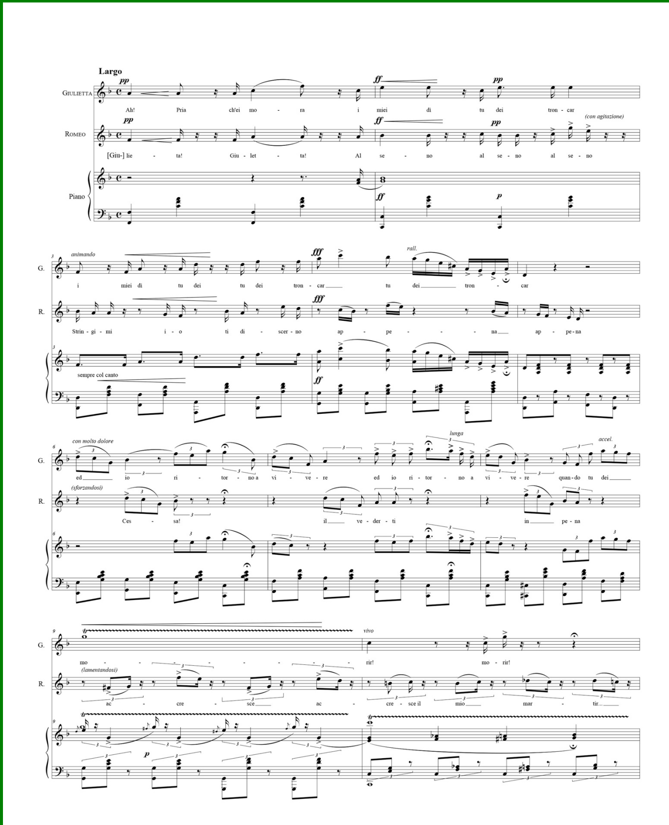
Example 3. Morales, Romeo, "Duetino final (b)," mm. 1-10.