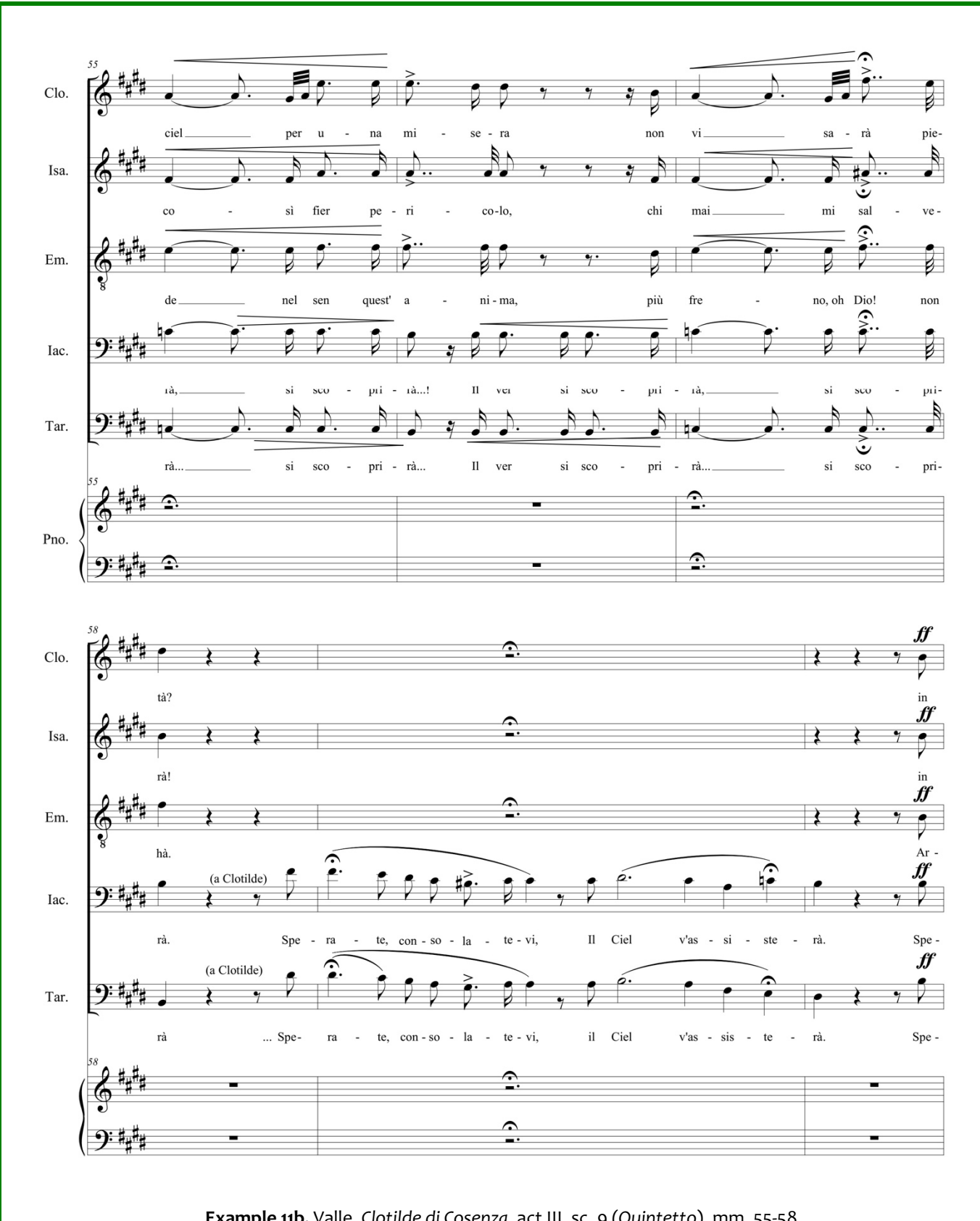
Example 11b. Valle, Clotilde di Cosenza, act III, sc. 9 (Quintetto), mm. 55-58.