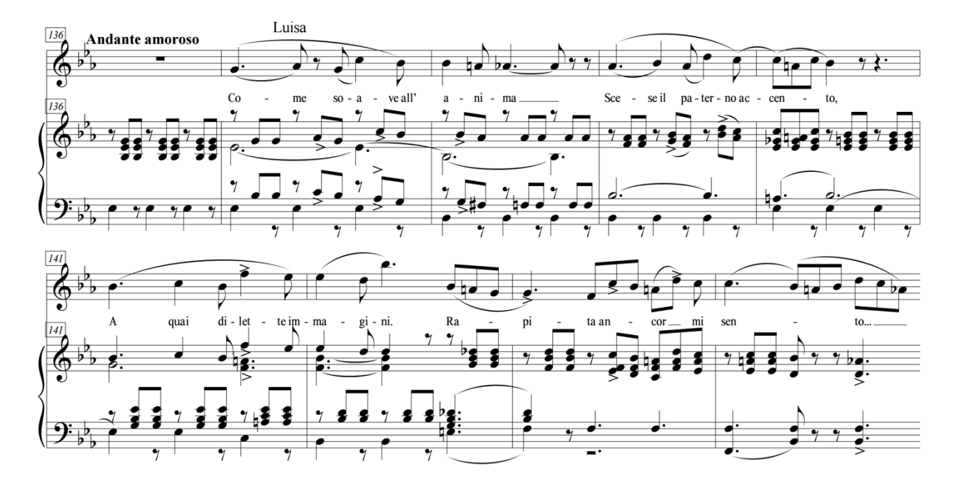
Example 6. Paniagua, Pietro d'Abano, Nr. 5, sc. 4 (Cavatina Luisa), mm. 136-144.