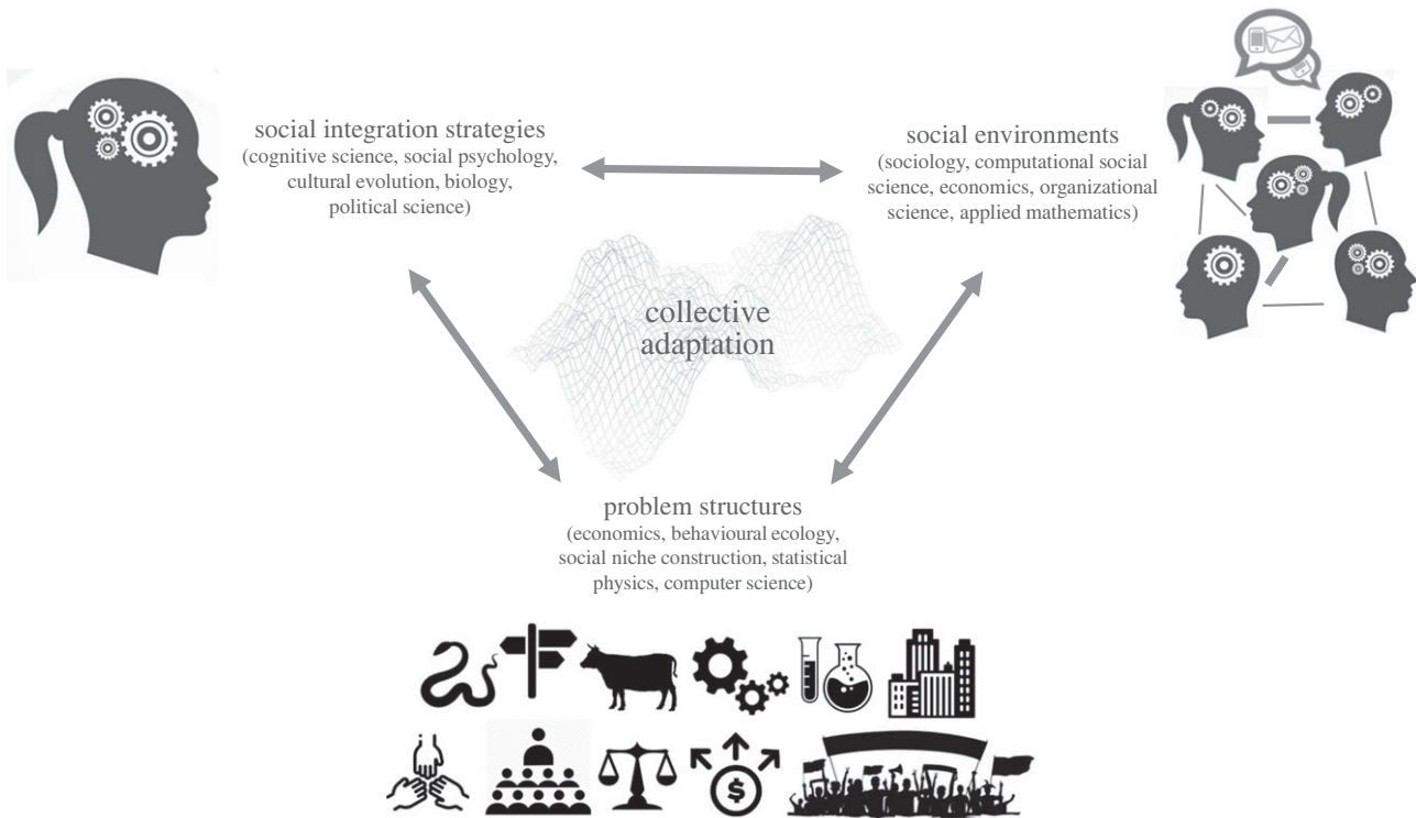
Figure 1. Collective adaptation can be seen as an emergent property of a complex socio-cognitive system driven by dynamic interactions of social integration strategies, social environments and problem structures collectives face. Collectives take different trajectories when navigating the complex adaptive landscape of these interactions. The system components are wholly entangled, but each has been studied in relatively isolated disciplines, and extant models of collective dynamics rarely include all components. Combining relevant findings and methods in different disciplines (box 1) is critical for understanding collective adaptation, avoiding parallel efforts (box 2) and building quantitative models that enable answering important outstanding theoretical and practical questions about human sociality.