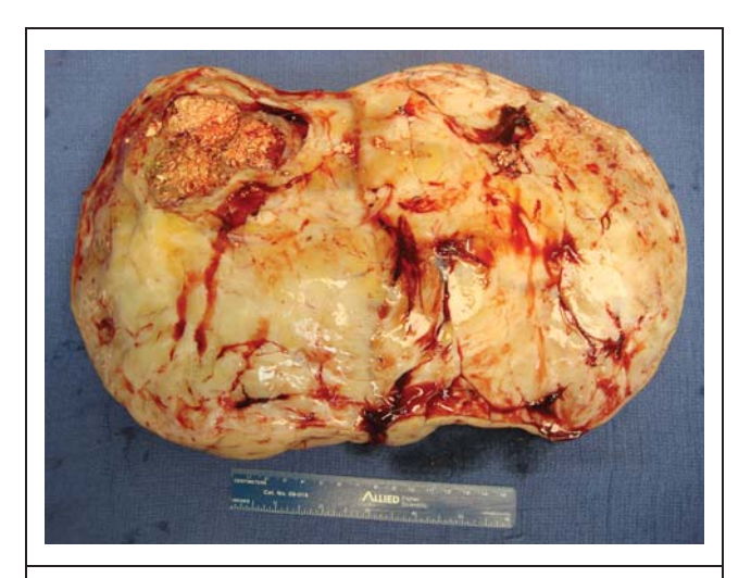
Figure 5 In this cross-section of the tumour, a calcified portion of the giant pilomatrixoma is seen in the upper left. The entire tumour is surrounded by extensive oedematous subcutaneous tissue. A 15-cm ruler is placed near the mass as a comparison

contrast enhancement of our patient's lesion were typical of a pilomatrixoma. The extensive soft tissue around the pilomatrixoma contributed to the total size of the mass and led to a clinical impression of soft tissue sarcoma. Differential diagnostic considerations are shown in Table 1.