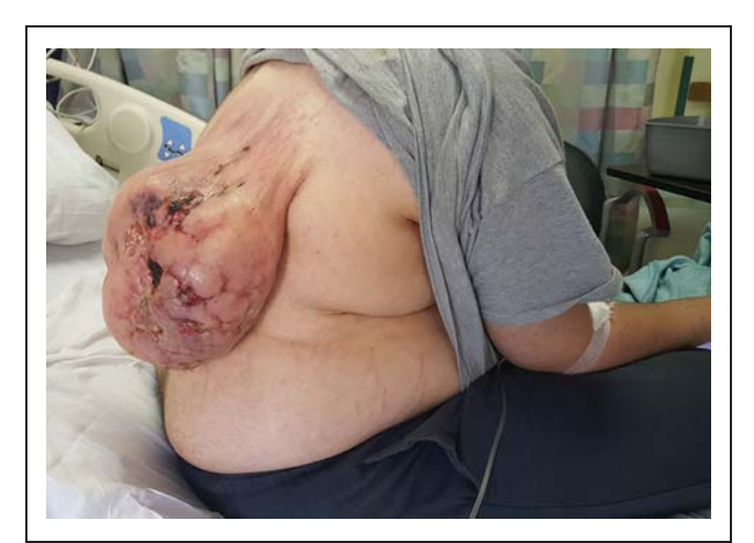
Figure 1 \, A large mass is noted on the right upper back of the patient

preceding year and had developed intermittent bleeding according to the patient. The patient did not inform his parents about the increase in size of the mass over the years. Computed tomography was ordered, which showed a large pedunculated and centrally calcified soft-tissue mass arising from the right posterior back in proximity to the right trapezius muscle, with large feeding vessels (Fig 2). Imaging did not show deep bony or muscle invasion. The boy was