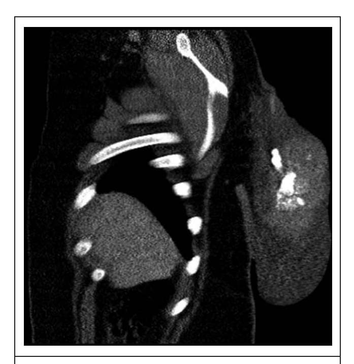
Figure 2 A sagittal computed tomographic view of the patient shows the back mass with internal calcification

Histological sections demonstrated a sharply circumscribed neoplasm composed of keratinised 'ghost cells' with focal basaloid cells with a high nuclear to cystoplasmic ratio (mitotically active without atypia) and no necrosis. The mass was surrounded by an extensive oedematous subcutaneous-type tissue with fibrosis, lobules of capillary proliferation, lymphatic dilatation and patchy lymphocytic inflammation (Fig 4). The mass weighed 3222 g (Fig 5).