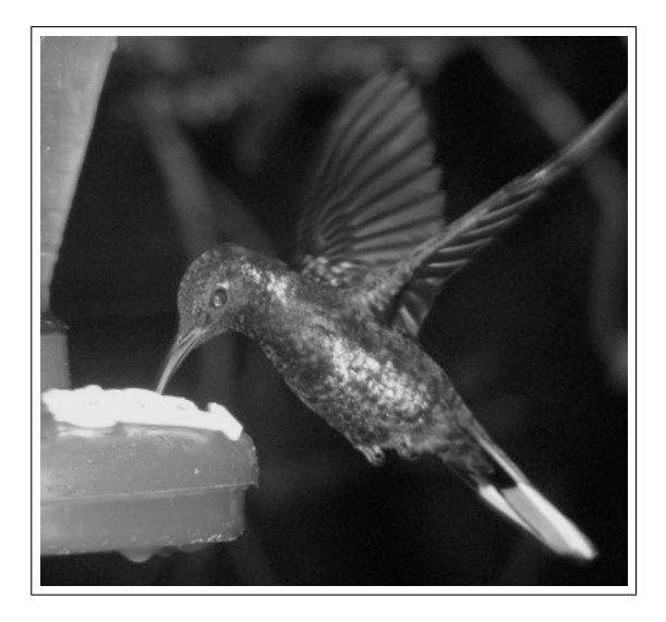
Figure 4: The beak and the feeder share no common history.