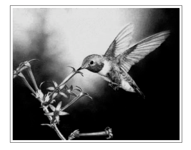
Figure 1: The hummingbird's beak and the flower share a long history of co-evolution.

I wish to take this (perhaps perplexing) analogy seriously. To do so, it is useful to consider the phylogenesis of perception/action systems, and to extend our view back to the epistemological situation of a single cell. This example has