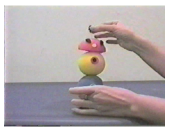
Figure 1. An example of the stimuli used in all experiments

The stimuli were digitized movies of videotaped events in which a hand performed one of four actions (squeezing, rolling, inverting, or pulling a part away from the body of the object) on an object with one of four appearances (see Figure 1).