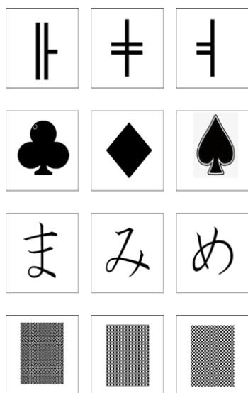
Figure 1: Stimuli used for categorisation task. Each row represents a set of cues.

The category structure was arranged so that there were set inconsistent (SI) and set consistent (SC) cues. SI cues were those with an outcome-association inconsistent with the