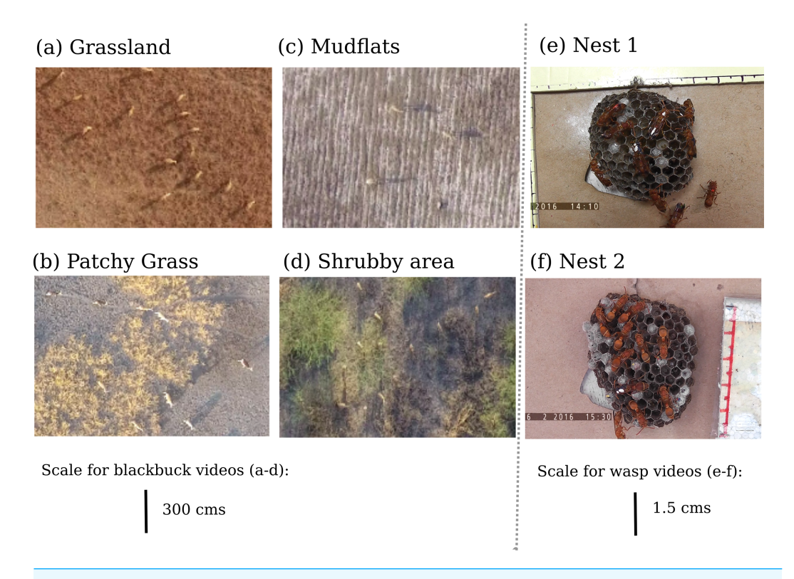
Figure 2 Variation in the appearance of animals and background in different videos. Variation in the appearance of animals and background in different videos: blackbuck herds in a (A) grassland, (B) habitat having patches of grass, (C) mudflat area of the park, (D) bush dominated habitat. Wasp nest with a majority of (E) older wasps, (F) newly enclosed wasps.

Full-size DOI: 10.7717/peerj.15573/fig-2