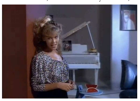
Figure 1: Kylie alone in "I Should Be So Lucky"

Musically, the song also strands her in a Fortress of Synthesizer Solitude, all bright, woodless electronic blips and chirps. In her plastic isolation, Kylie can do nothing but stare at a photograph of an anonymous hunk (one YouTube wag quips, tellingly, "wich version is the iPad she's holding in 1:12?" he oversized photo frame rhyming with the coming images in which Kylie dances in front of a green-screened children's drawing, herself becoming a primary-colored scrawl to mount on your refrigerator. Everything works to strand Kylie, to leave her alone, cut off from anyone else, in a world all her own – mirroring, in this way, the