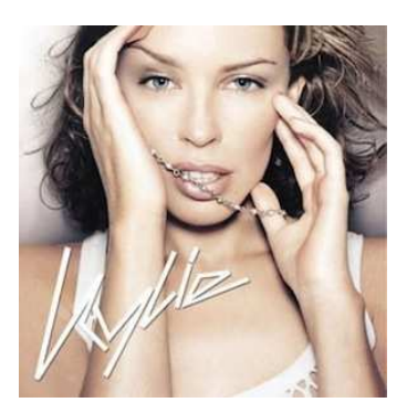
Figure 7: The UK release of Fever, the single of "Can't Get You Out of My Head," the US release of Fever