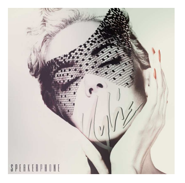
Figure 8: The X and the signature: X album cover; verso and spine of X; "Speakerphone" single cover

Even then, Kylie doesn't make it easy for us. Where does she sign the album?<sup>670</sup> Not on the cover, where the X only perhaps appears in the shape of the butterfly-shaped, honeycomb-mesh veil that covers her face. Not on the disk itself (record or CD), which is emblazoned with an X the legs of which only cross – and what defines an X besides this crossing? – at the missing center of the disk. And not even on the back cover (whose colors are the solarized negative of the front cover's), where, in addition to the veil, Kylie now wears an X over her now half-open lips; here the X signifies not the expression of Kylie in some other medium, but instead the silencing of Kylie – the sealing of her lips. Indeed, on the recto Kylie brings a finger to her lips, silently miming for our voices to fall silent. Perhaps the only authentic X on the album is the tiny one written on the spine of the jewel case. Logical, that, since the spine is perhaps the place where recto and verso cross over into each other, precisely inasmuch as the spine is neither recto nor verso. Cleverly, then, X cannot be hieroglyphic: the spine is the place where images cancel each other out, and is only useful for filing the album alphabetically on your shelf. Kylie's X is ideally, radically Symbolic, a figure from an algebraic nightmare, nothing but a letter, forcing you to wait for it and read it on your own.