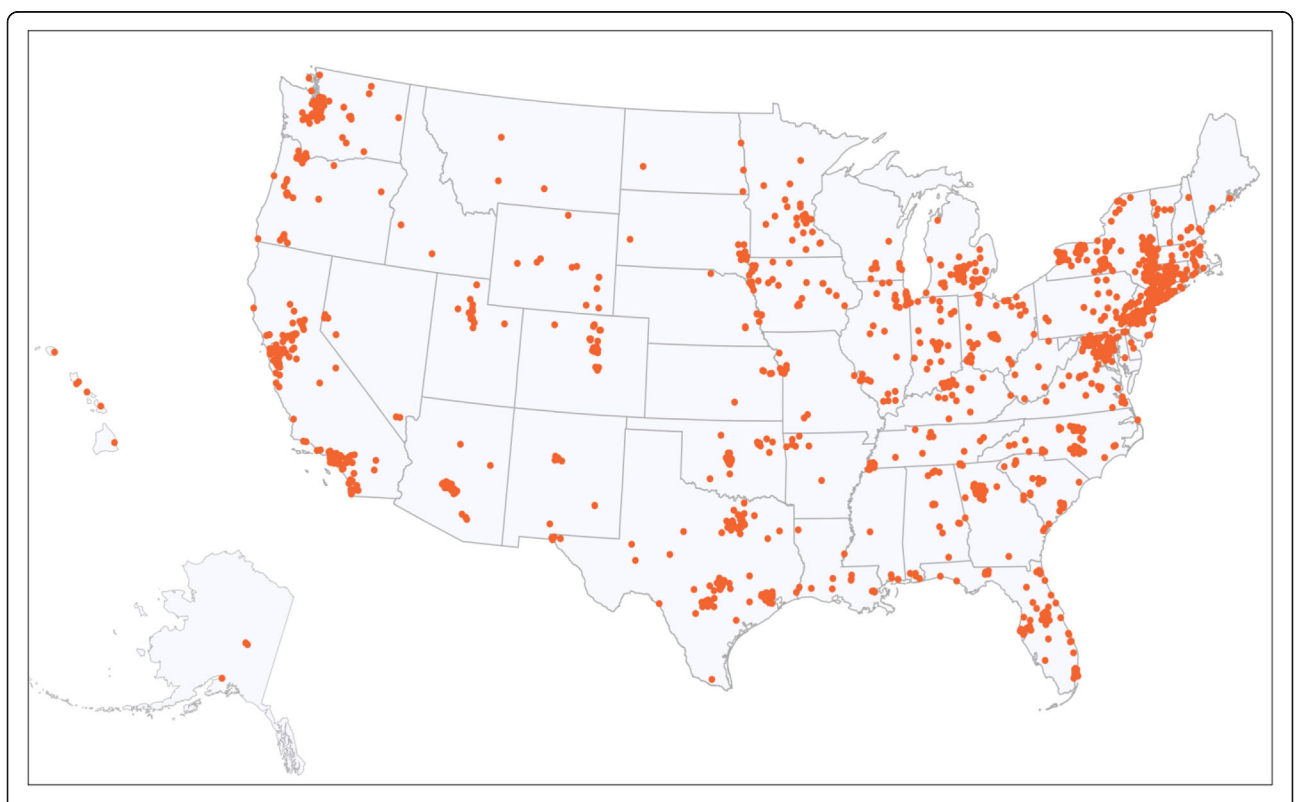
Fig. 2 Map of zip codes, representing maternal residence at time of pregnancy

One in six women (17.3%) in our sample experienced one or more types of mistreatment (Table 2). Being shouted at or scolded by a health care provider was the most commonly reported type of mistreatment (8.5%), followed by "health care providers ignoring women, refusing their request for help, or failing to respond to requests for help in a reasonable amount of time" (7.8%). Fewer women reported violation of physical privacy (5.5%), and health care providers threatening to withhold treatment or forcing them to accept treatment they did not want (4.5%). Very few women reported physical abuse, sharing of their personal information without consent, or healthcare providers threatening