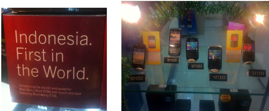
Images from a shopping mall in Surabaya: BlackBerry predominating and associated with cutting-edge devices. The rupiah exchanges for approximately 1 US$ = 9,500 Indonesian rupiah.

stereotypes of BlackBerry usage in the United States, Indonesians rarely use BlackBerry phones for email—BBM is the primary mode of communication used.