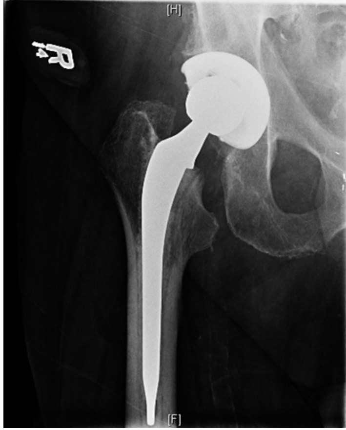
Image 3. Post reduction anterior-posterior radiograph of the right hip demonstrating normal joint alignment.

In comparing US-guided regional nerve blocks to more traditional anatomic "blind" approaches, US-guided blockade can be accomplished with improved accuracy and efficacy. <sup>10</sup> Additionally, US-guided femoral nerve blocks have improved time to onset of anesthesia when compared to an approach using a nerve stimulator to identify the femoral nerve. <sup>11</sup> Since US-guided approaches to regional anesthesia offer significant improvements over other approaches, and prior studies have demonstrated the efficacy of femoral nerve blocks or three-in-one blocks for analgesia, it is reasonable to assume that regional anesthesia could be applied to patients with hip dislocations.