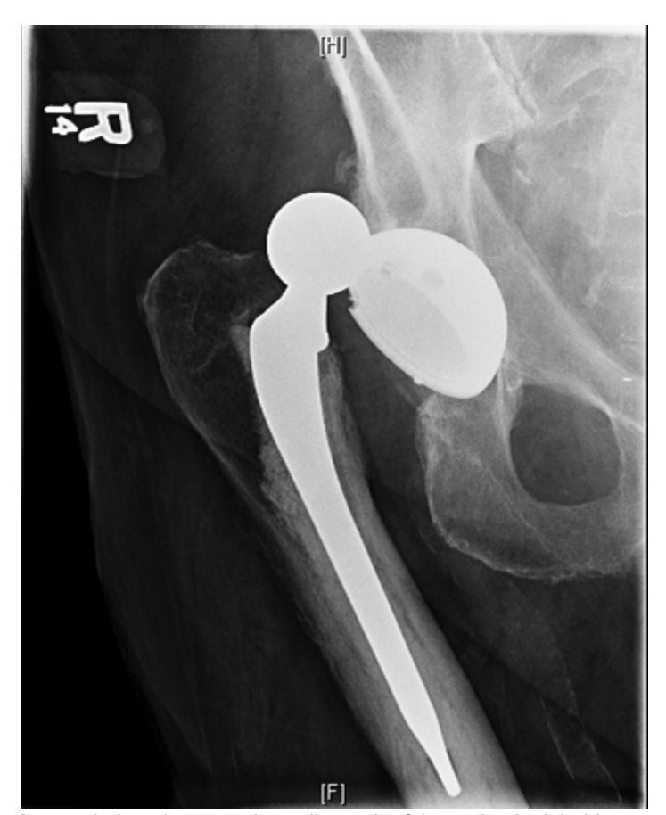
Image 1. Anterior-posterior radiograph of the patient's right hip demonstrating the hip prosthesis dislocated superiorly. Lateral films (not shown) indicated posterior displacement as well.

The patient then received a femoral nerve block following the three-in-one technique outlined previously (Image 2). The