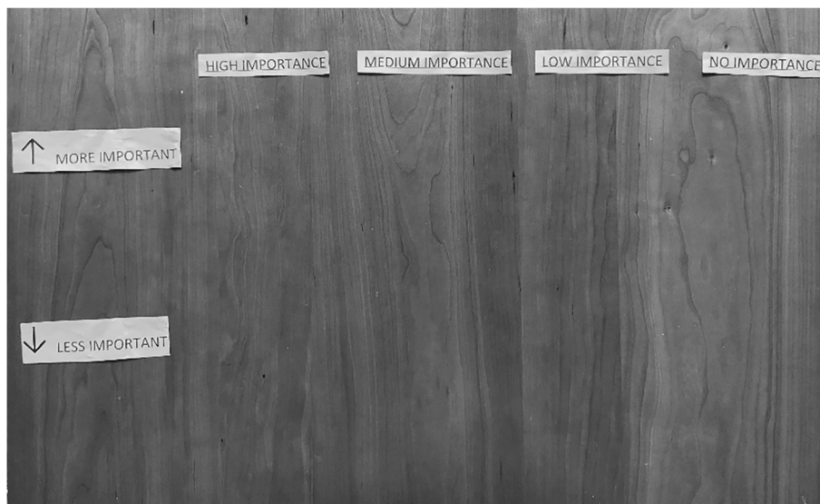
Fig. 1 Visual of Pile-Sorting Task Activity. Note: Participants were able to place items under each bucket and then to rank order those items within each category of importance

prescribed” and “stop taking my suboxone someday” in the same pile, the overall inter-item matrix would have a 28 in the second row-first column. The process of creating the matrices was automated using the R Statistical Programming Environment [41].