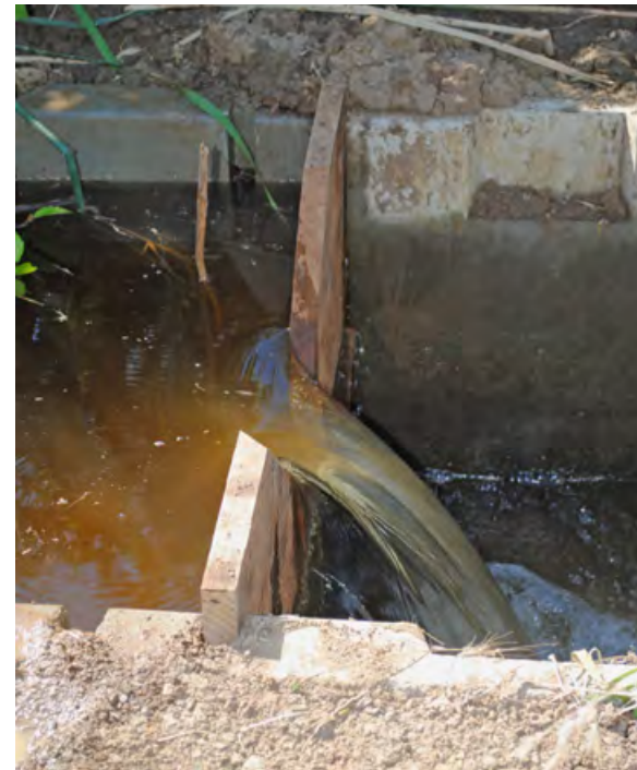
Figure 8. 90° V-notch weir.

A framing square can be used to lay out the 90° angle. Water needs to fall across a sharp edge of the weir crest. The angle of the V-notch should be cut at no less than a 45° angle, such that water falls freely from the weir. Figure 8 depicts an installed V-notch weir.