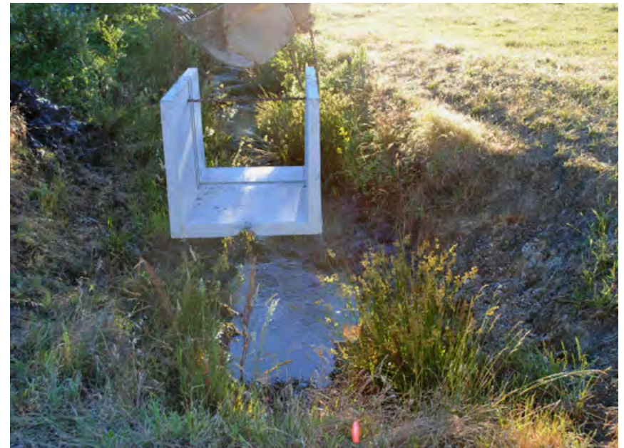
Figure 2. Setting a precast weir with a backhoe.

Weirs can be built in place. To do this requires skill in building forms and pouring concrete. A simpler approach might be to purchase a precast concrete structure (fig. 2) with slots for boards (e.g., a rice box). Depending upon the size, these are generally modestly priced. However, equipment is required to unload and set the structure in the ditch. You can check with a local precast firm or look online for a dealer.