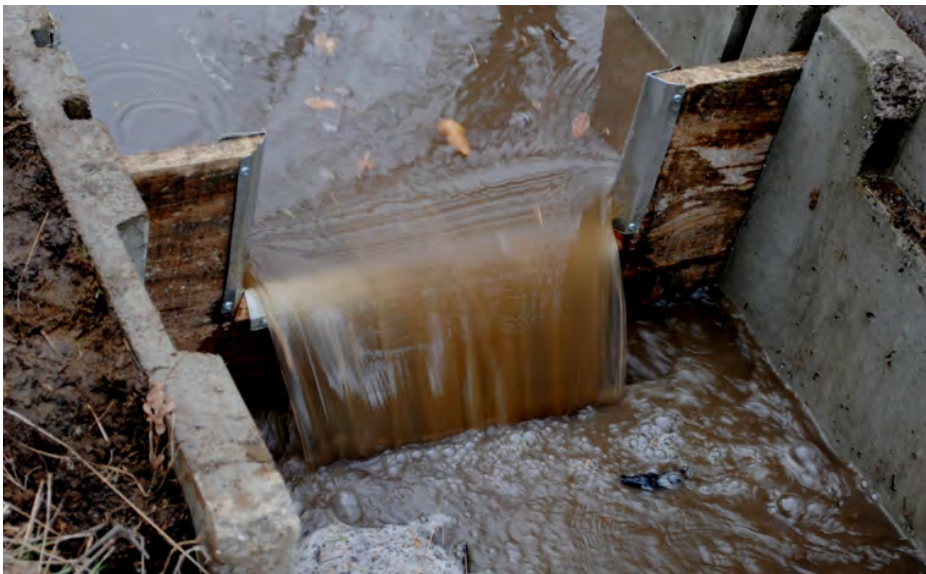
Figure 7. Rectangular weir.

Take a moment to review table 2. Note that flow can be determined from the table, based on the height of the water and the length of the weir crest. It is much easier to determine flow if the weir's crest is of a length that is included in standard, published tables. Water needs to fall across a sharp edge of the weir crest. The