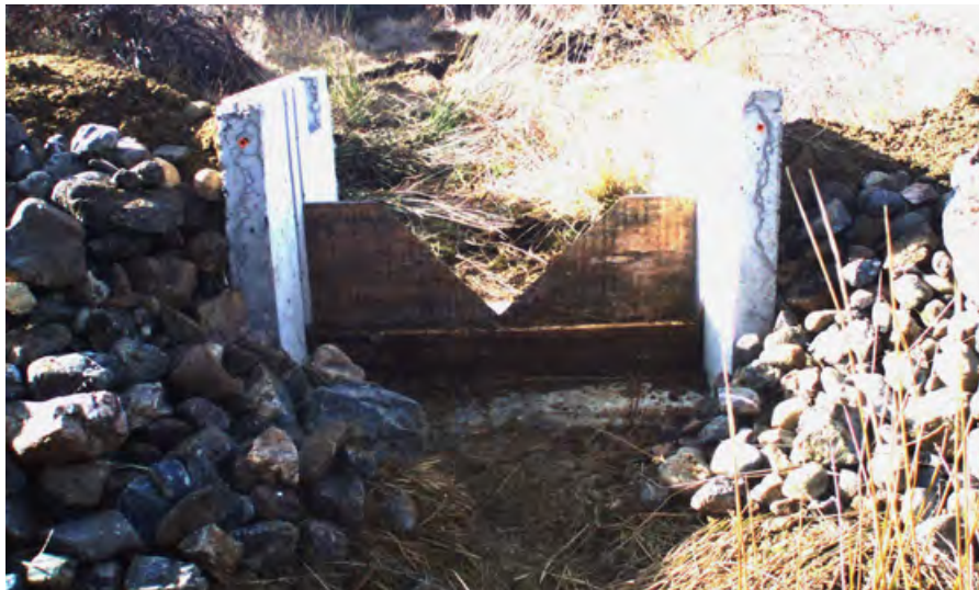
Figure 3. Precast weir with riprap.

Regardless of the approach taken, the structure must be backfilled in a manner to assure there are no water leaks around or under the structure. Diligent compaction of backfill material as it is added and use of riprap material on the waterside of the weir reduce the incidence of leakage around the structure (fig. 3). The use of bentonite may help reduce the chance of leakage around the structure.