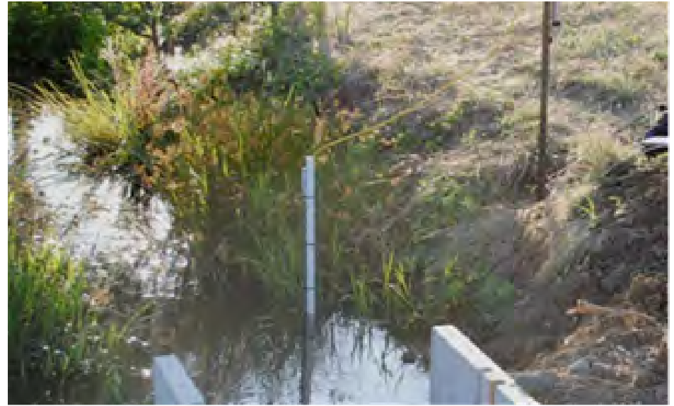
Figure 6. The pressure transducer is submerged below the water in the channel at a depth equal to the weir crest and is tied to the witness post. The transducer cable extends from the witness post back to the shoreline, where the datalogger storage device is tied to a T-post.

The most common device used to measure water height is some sort of ruler (frequently referred to as a staff gauge) mounted to or hung on the witness post. It is easiest to do this with a ruler that is divided