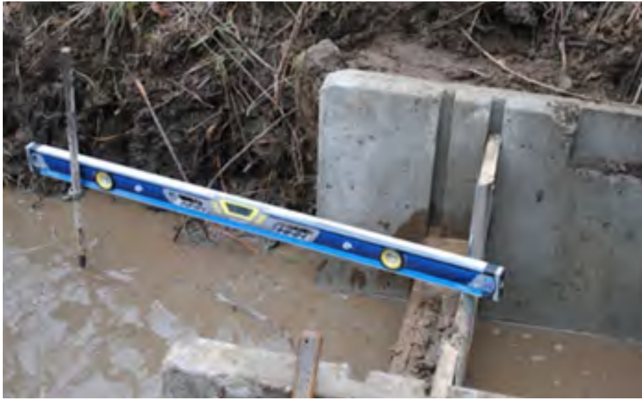
Figure 5. Leveling the witness post to the weir crest.