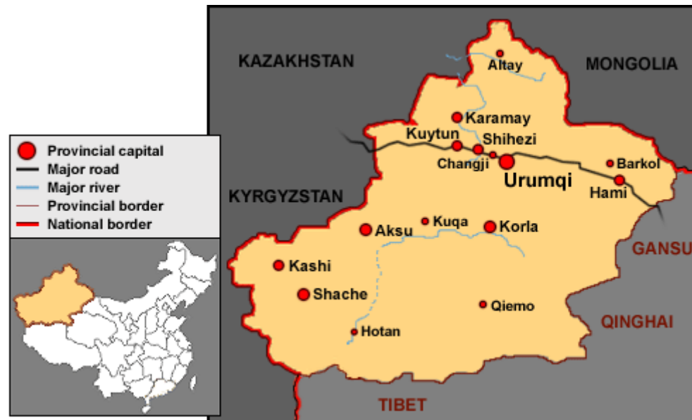
Figure 2: Map of Xinjiang with major cities

In 2007, I lived in the Xinjiang Uyghur Autonomous Region in northwestern China, an area that comprises one-sixth of the country's land mass. I spent the first half of the year in Urumqi, the regional capital in the north, and the latter half in Kashgar, a smaller city of 200,000, close to the Tajik and Kyrgyz borders. Urumqi is a city of 2 million residents, more than 70 percent of whom are Chinese. Erdaoqiao, the city's main Uyghur neighborhood, is