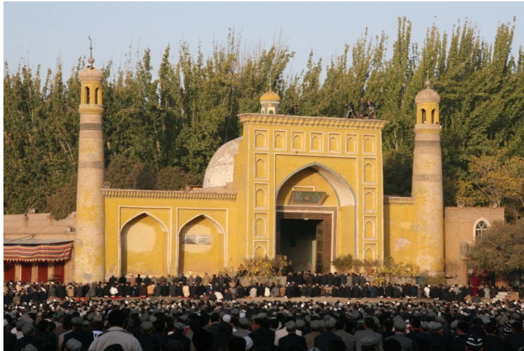
Figure 9: The Id Kah mosque in Kashgar