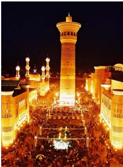
Figure 4: The Grand Bazaar

Peride and Rahile work across the street from each other in Erdaoqiao, the Uyghur neighborhood in Urumqi. Peride settled into her current home via a circuitous route that began in Kashgar and wove through Shanghai and back through her hometown. Rahile boarded a bus in Ghulja, in northern Xinjiang, and never looked back. Peride is portly, with a grandmotherly bosom before her time, and wears long skirts and wide headscarves. Rahile is known as the neighborhood beauty, with careful makeup and pressed skirts and blouses. She wakes early to dress and coif before opening the dry cleaning store she manages. Peride rises even earlier to pray and prepare breakfast for her two sons and husband. Through different paths, each arrived in Erdaoqiao, a place that captures the hopes, possibilities, and contradictions of the emerging Uyghur middle class. It is a neighborhood – a Uyghur neighborhood – where money can be made, where Uyghur fashions and crafts are displayed next to Chinese and foreign goods, and where outstanding Uyghur professors teach. Yet, its singularity poses a challenge to the vision itself.