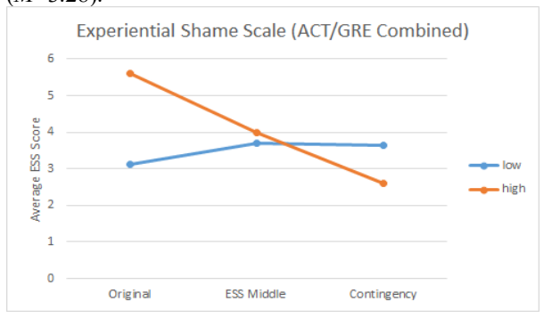
Figure 1. Average ESS score across both the GRE and ACT.

produced significantly higher ESS scores (M=4.55) compared to the ESS Middle (M=3.84), and the Contingency group (M=3.26). Additionally, participants that were "high" shame prone (M=4.6) scored significantly higher on the ESS in the Original condition compared to participants in the Original condition that were "low" shame prone (M=3.28).